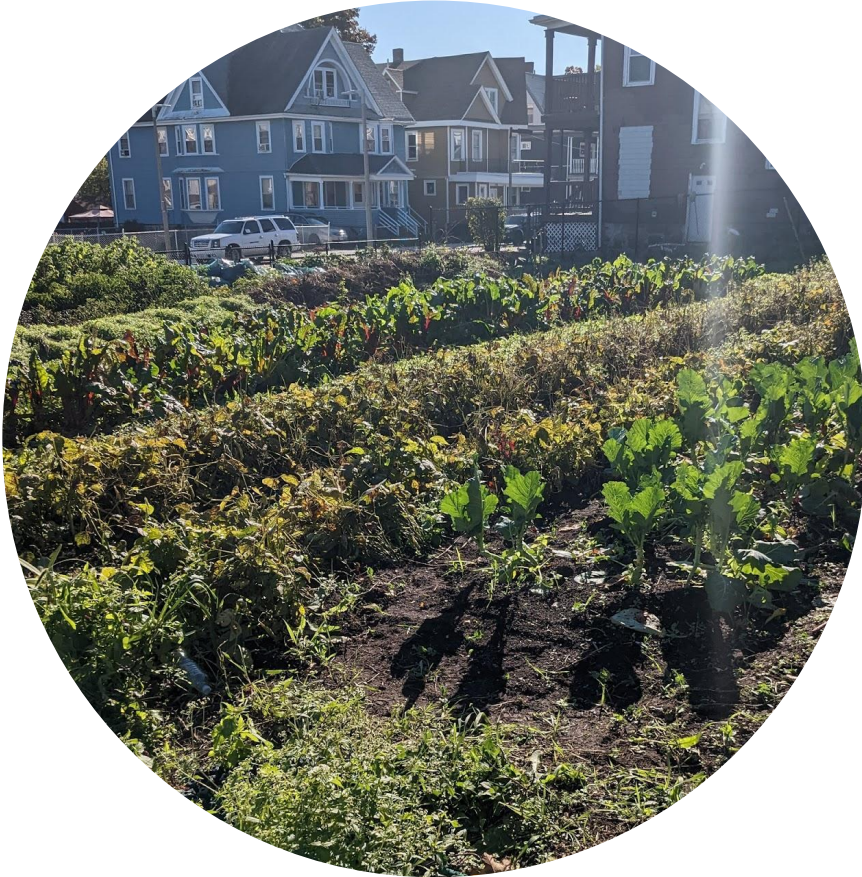
The Food Project – East Cottage Farm