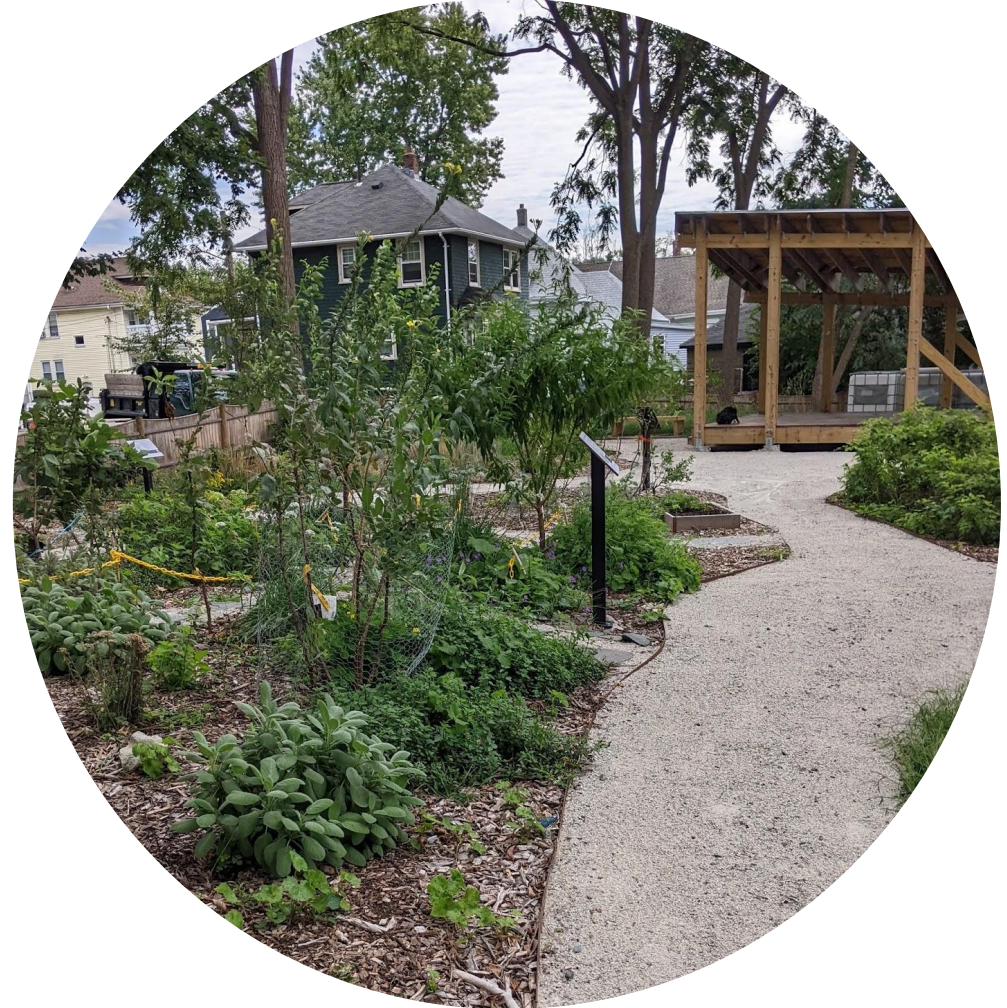
Edgewater Food Forest, Mattapan