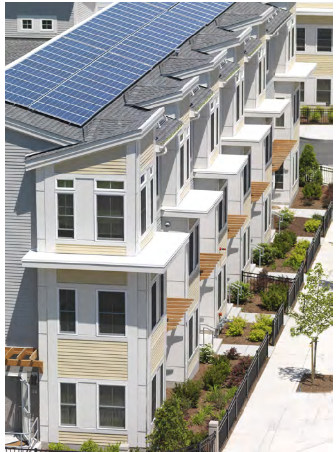
Solar panels on Old Colony BHA housing

The City will continue to work on educating renters and homeowners alike about projected climate impacts, and what they can do to prepare their homes. Simultaneously, the City will explore policy options, planning initiatives, and incentives to ensure that new and existing housing is prepared for the effects of climate change.