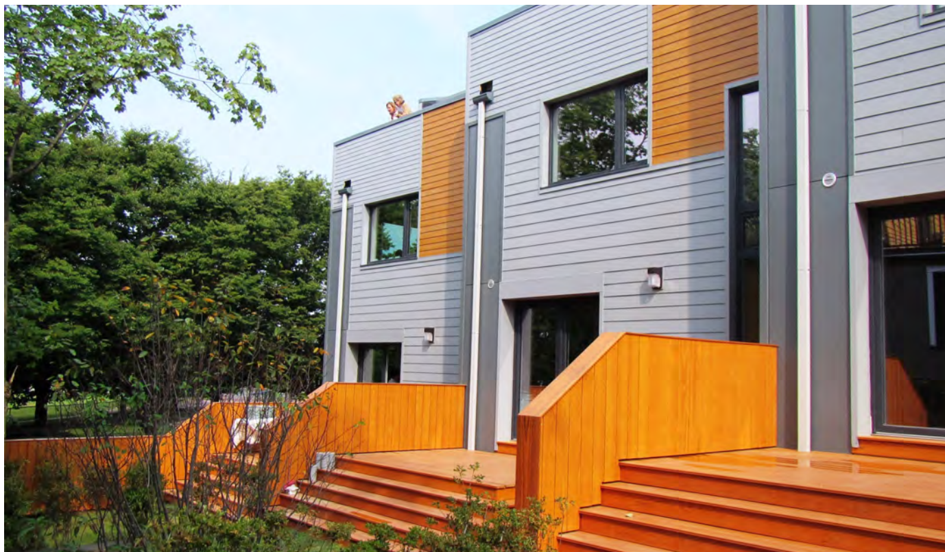
Boston's first Energy+ housing development in Roxbury produces about twice as much energy as it consumes.

While greening new construction is important, Boston must also make significant improvements to its existing building stock, both in terms of energy efficiency and climate preparedness. Since only one percent of the city's building stock is replaced each year, an extensive retrofitting plan is essential. The City of Boston, in partnership with the Commonwealth and the utility companies, has excellent residential energy efficiency programs. In 2013, Boston was named the most energy efficient city in the nation based on its policies and programs, and Massachusetts was named the most energy efficient state. Through the City's Renew Boston program, residents living in buildings with four or fewer units can receive a free energy assessment that