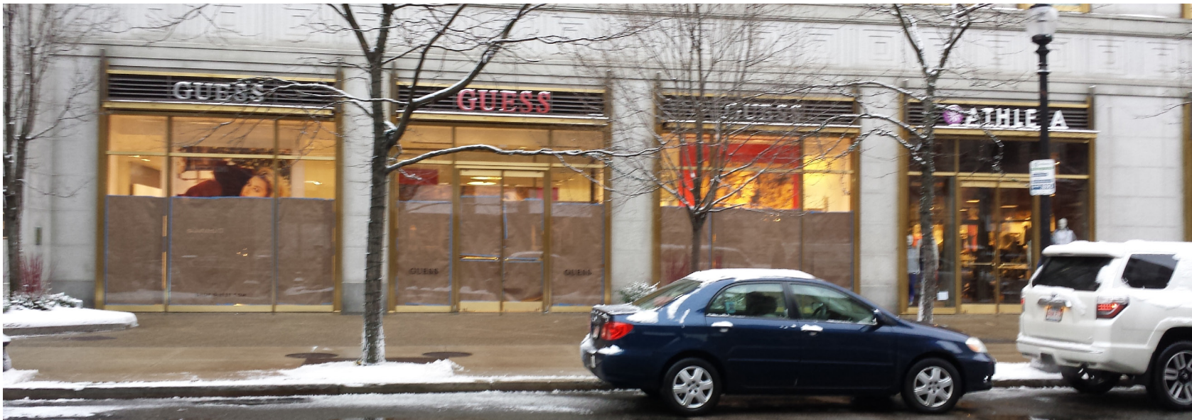
Photograph of Retail Storefronts West of Main Entry