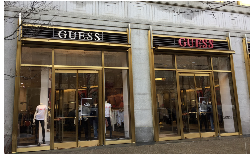
Photoshop Rendering of Proposed New Entry Doors