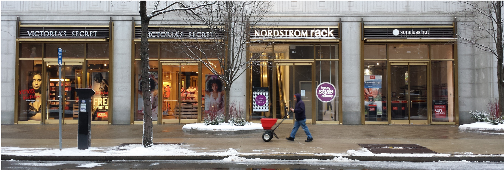
Photograph of Retail Storefronts East of Main Entry