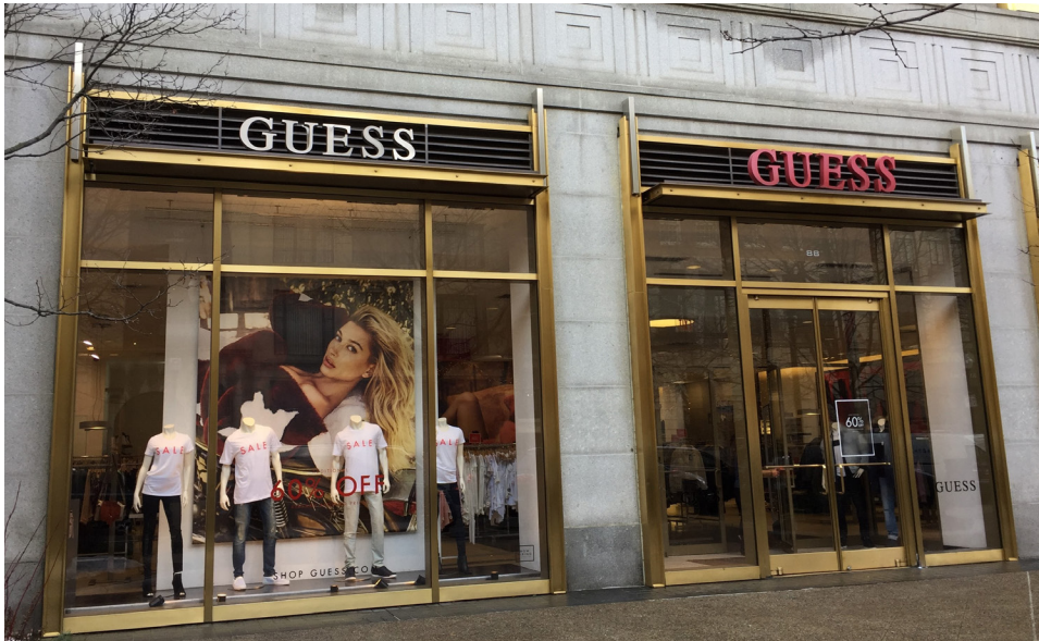
Photo of Existing Condition