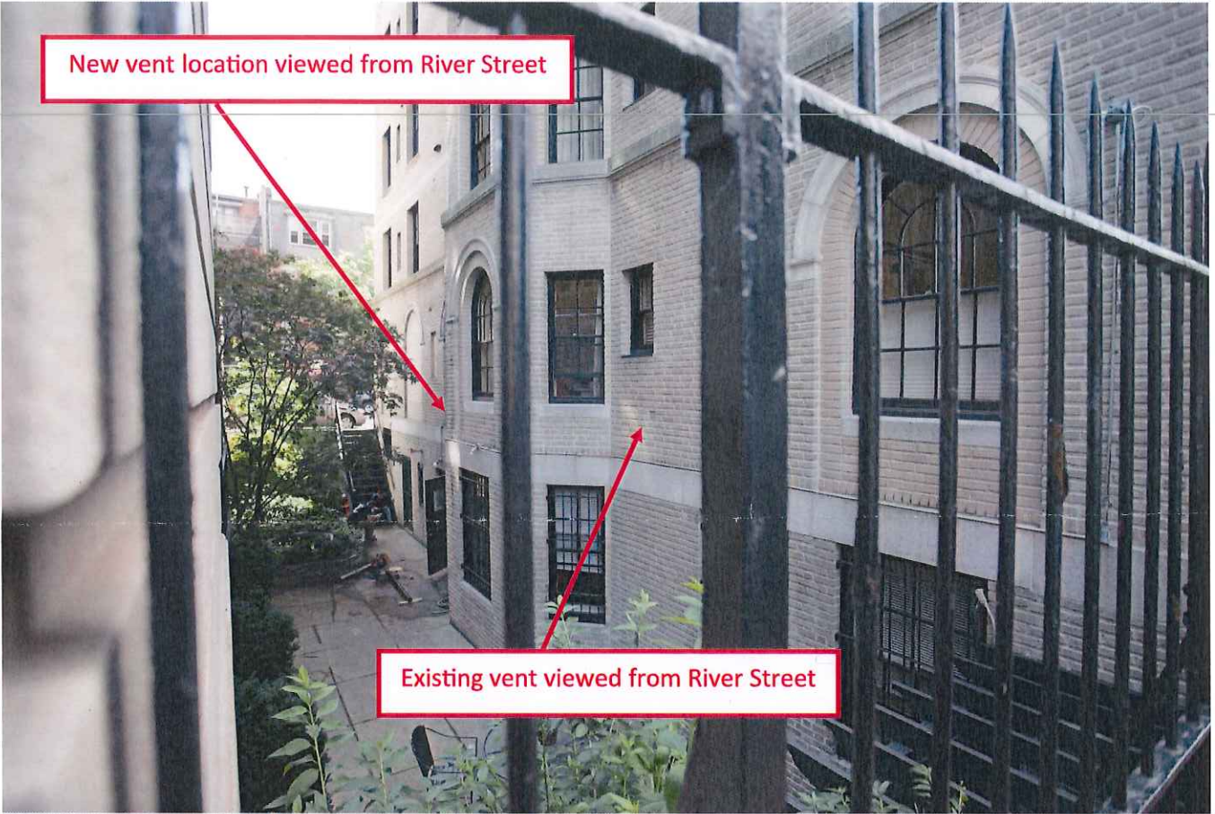
Existing vent viewed from River Street