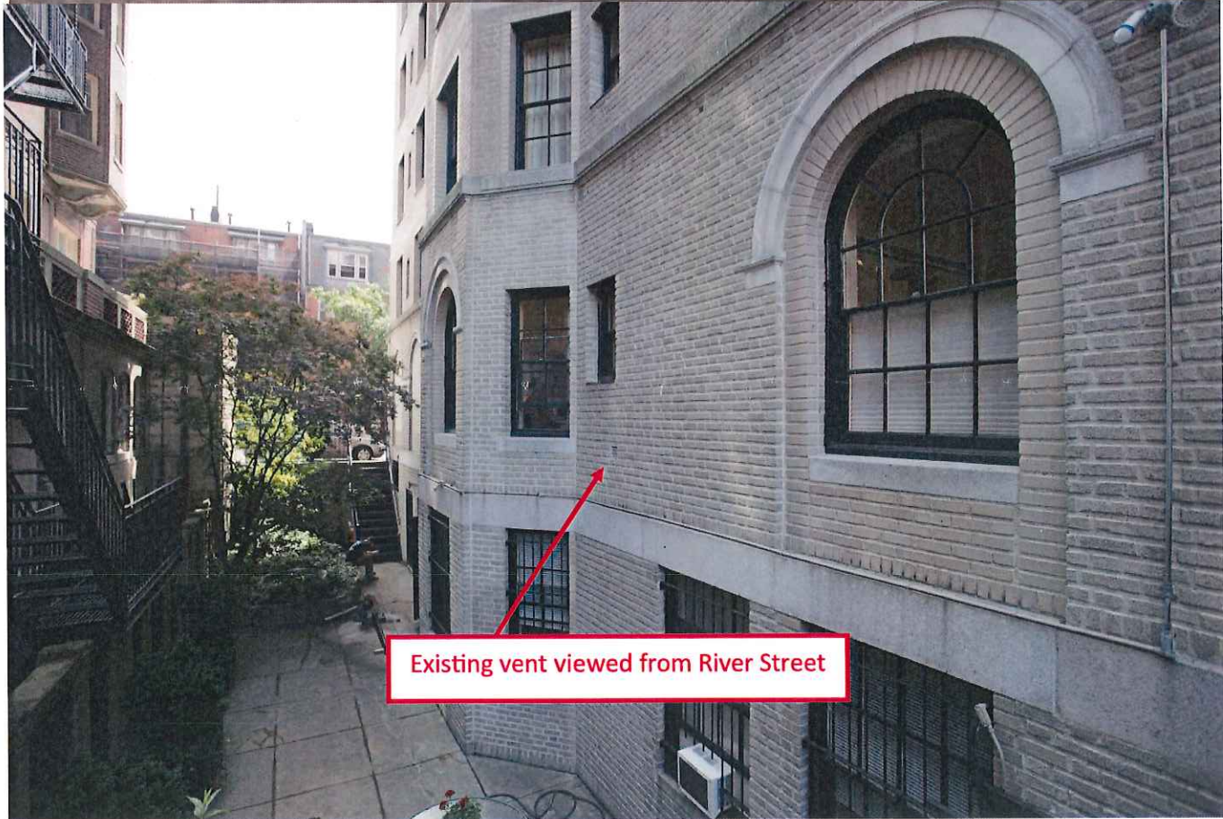
Existing vent viewed from River Street