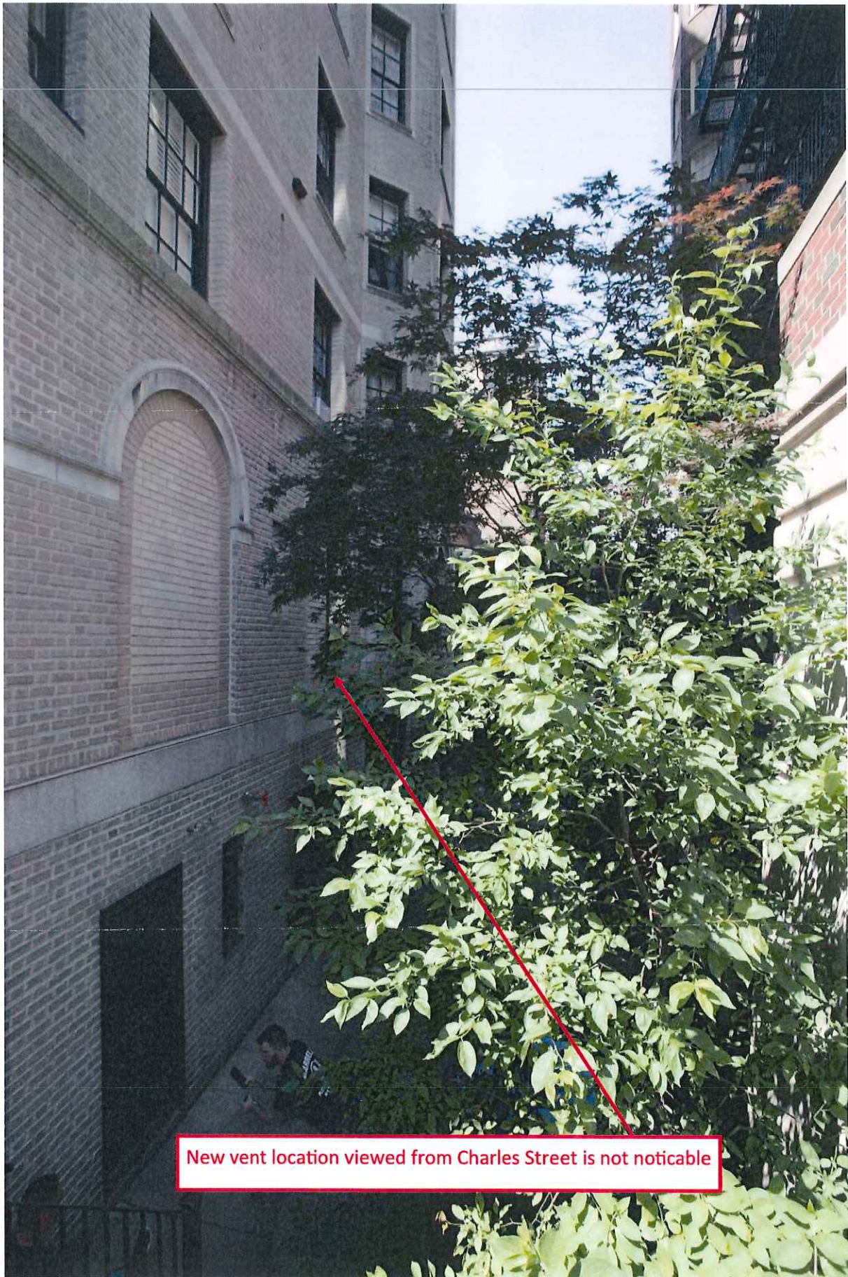
New vent location viewed from Charles Street is not noticable