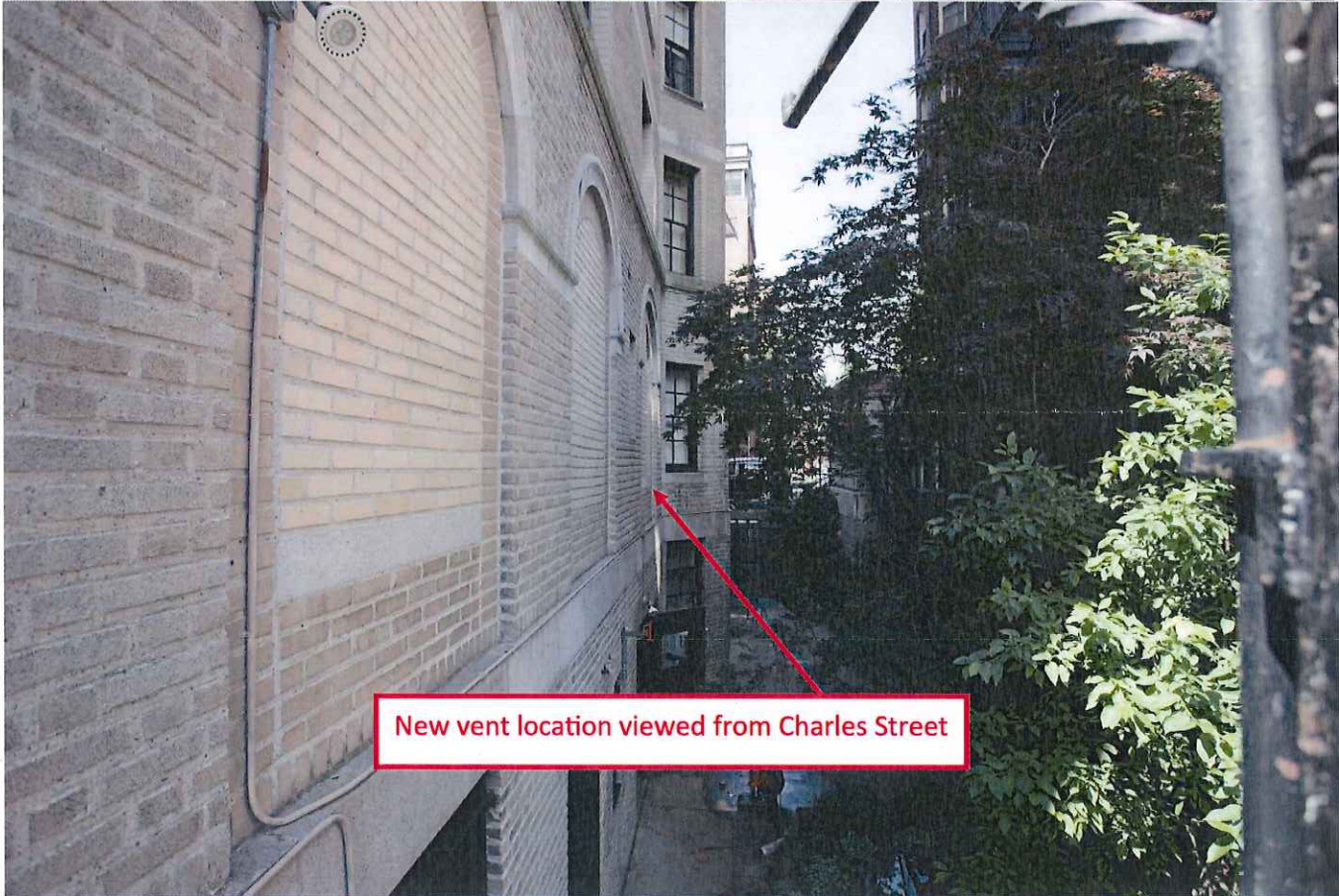
New vent location viewed from Charles Street