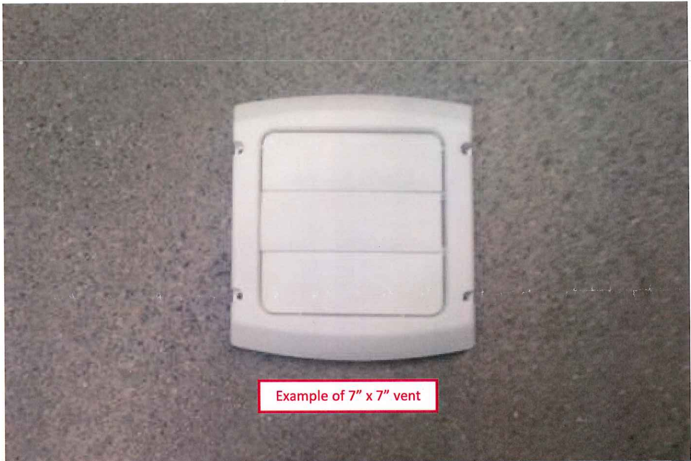
Example of 7" x 7" vent