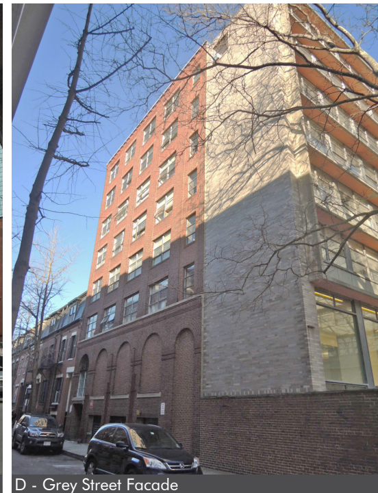
D - Grey Street Facade