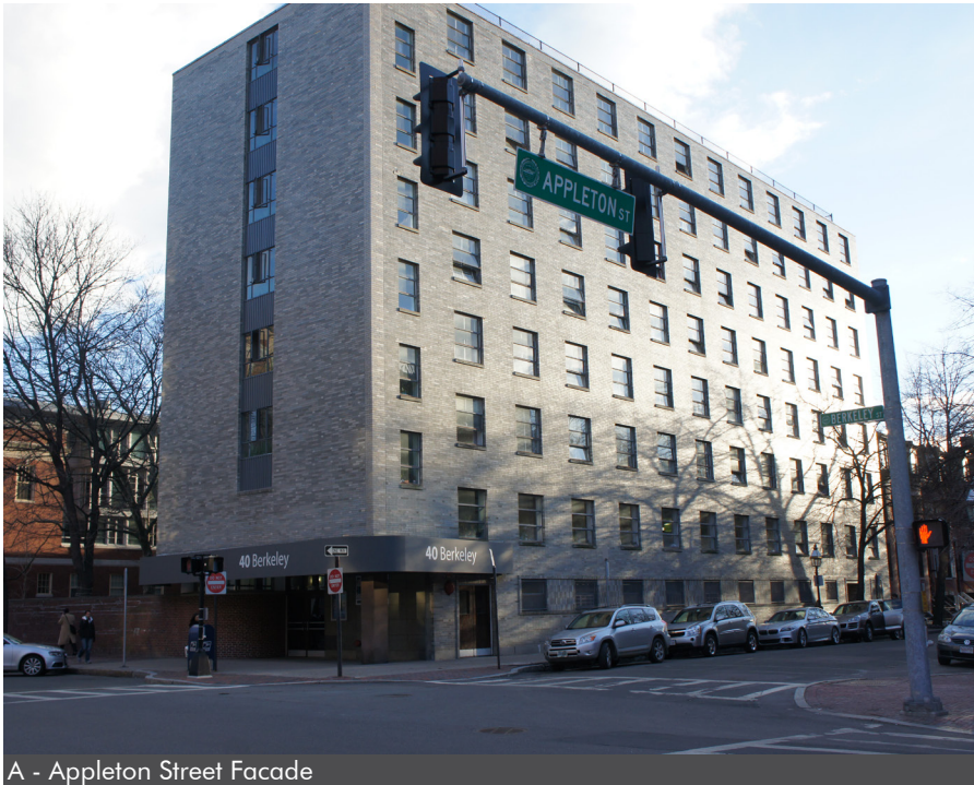
A - Appleton Street Facade