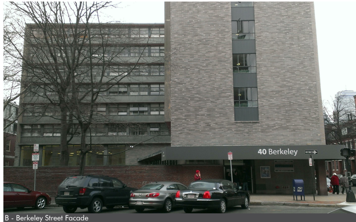
B - Berkeley Street Facade