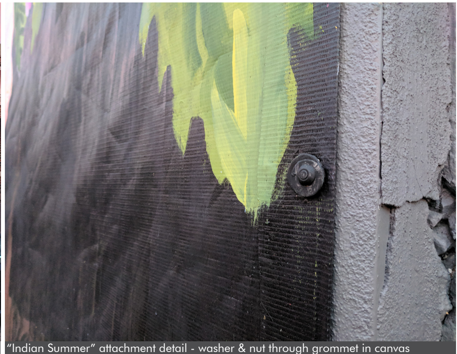
"Indian Summer" attachment detail - washer & nut through grommet in canvas