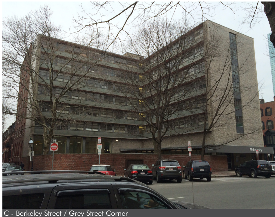
C - Berkeley Street / Grey Street Corner