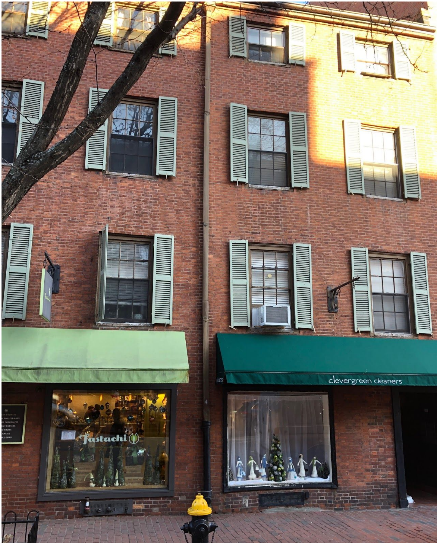
83 Charles (left) and 81 Charles (right)