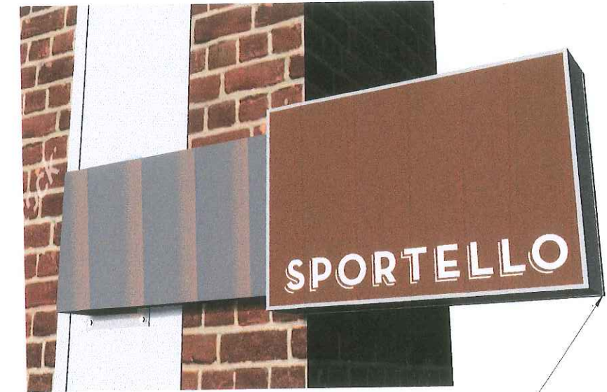
2 Perspective View Scale: NTS