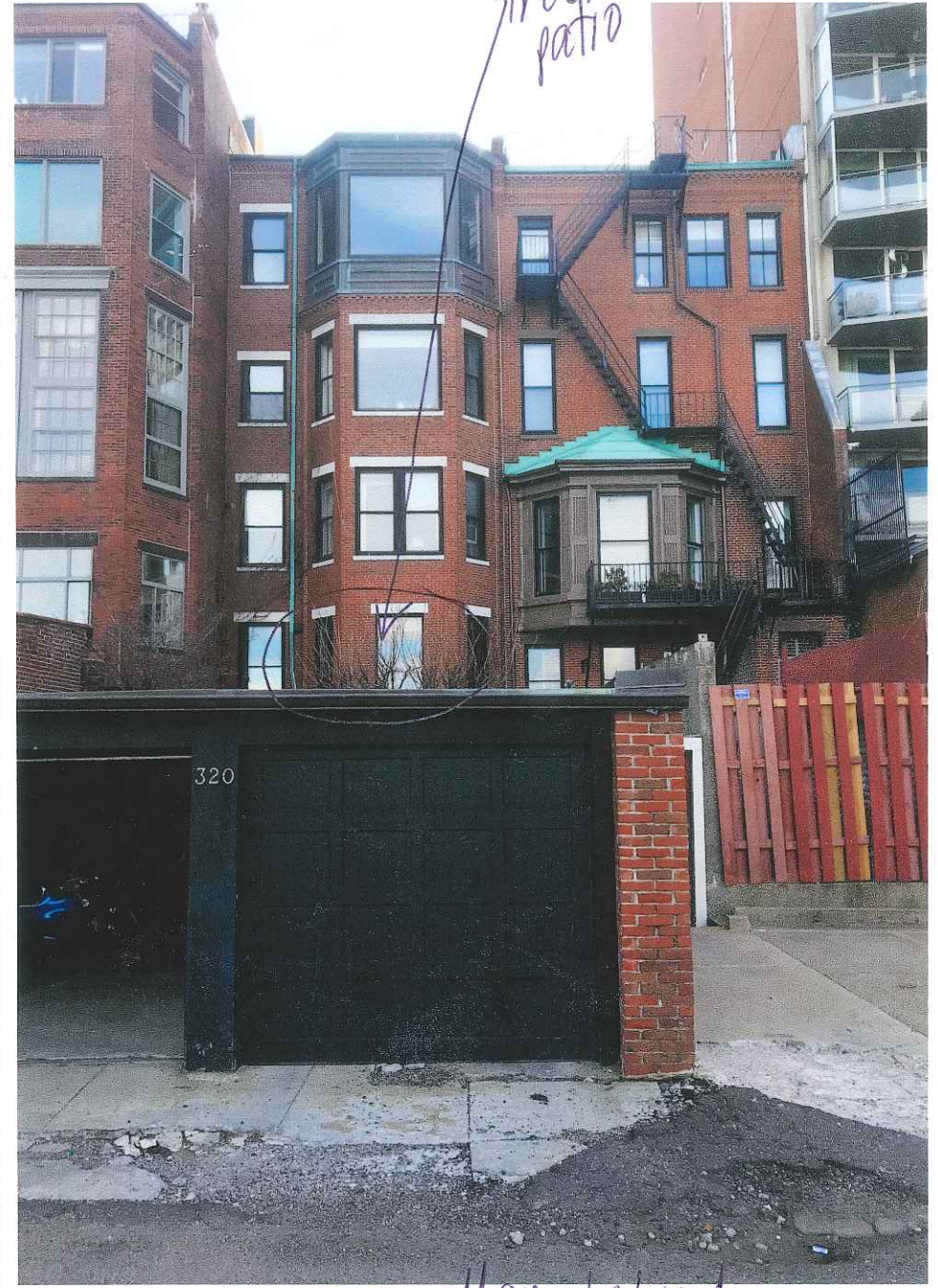
view from alley behind 320 Beacon St.