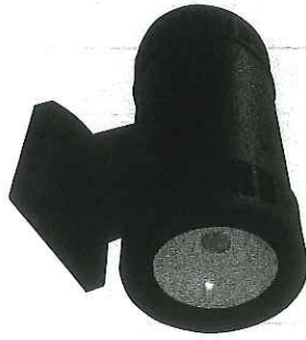
Astra LED Up/Down Wall Cylinder Model# WCTRDC3

20 Input Watts; 2,310-2,320 Delivered Lumens Replaces up to 100w HID