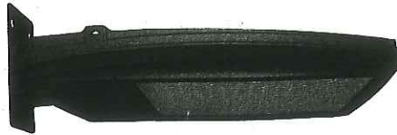
Hampton Large Kitty Hawk Wall Mount Model# KH45Q

DesignLights Consortium™ Qualified Luminaires: KH25QC1X81U5KC*** KH25QF1X81U5KC*** KH25QC1X112U5KC*** KH25QF1X112U5KC***