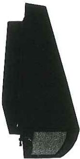
Astra LED Large Wallpack Model# TV3C3

DesignLights Consortium™ Qualified Luminaires: TV2C32X20U41K*