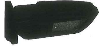
Hampton Mini Kitty Hawk Wall Mount Model# KH15Q

40 Input Watts; 3,390-4,500 Delivered Lumens Replaces up to 175w HID