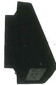
Astra LED Small Wallpack Model# TV2C3

DesignLights Consortium™ Qualified Luminaires: KH45QC1X167U5K*** KH45QF1X167U5K*** KH45QC1X256U5K*** KH45QF1X256U5K***