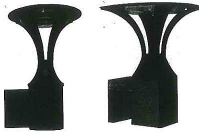
Sculptor Round & Square Sconce Model# WBB3Q & WBB4Q

DesignLights Consortium™ Qualified Luminaires: TV3C34X20U41K*