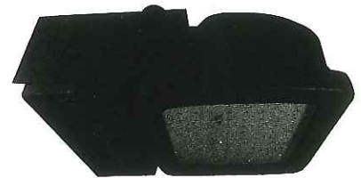
DurAdjust Wall Light Model# AD25Q

20 Input Watts; 1,540-1,620 Delivered Lumens Replaces up to 100w HID