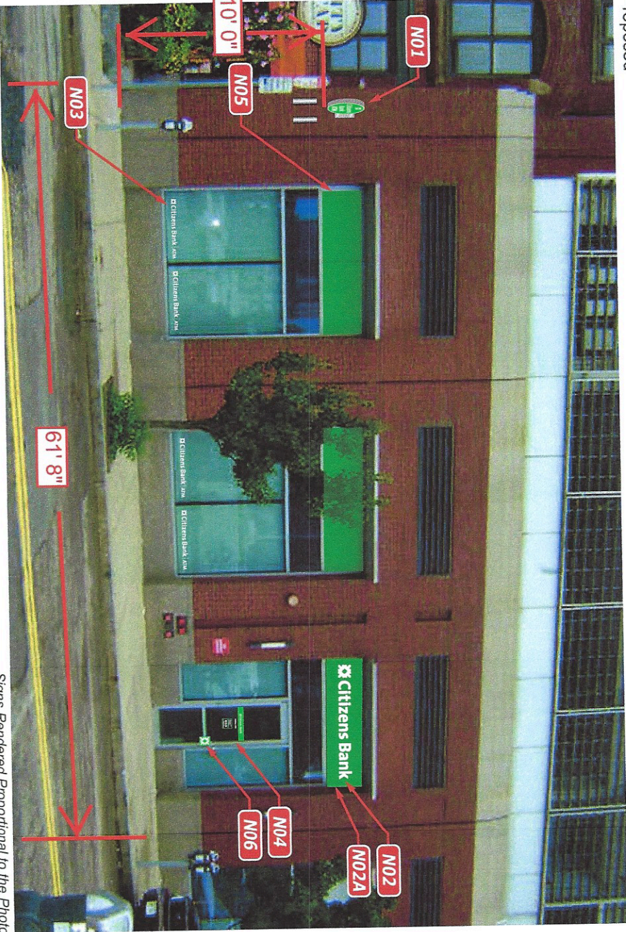
Signs Rendered Proportional to the Photo