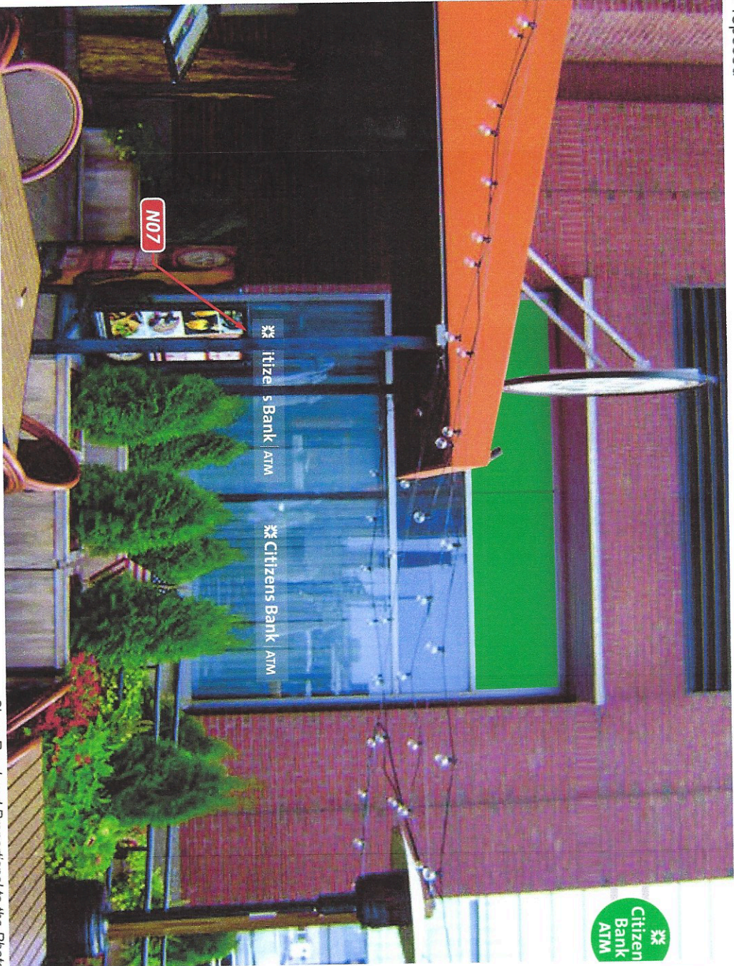
Signs Rendered Proportional to the Photo