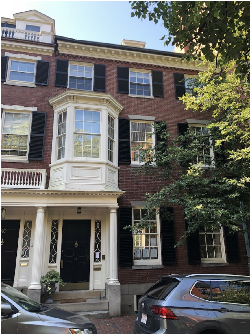
FRONT BAY REPAINT, MATCH EXISTING COLORS