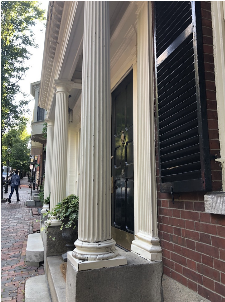
ENTRY COLUMN REPLACE ROTTED BASE IN KIND, REPAINT