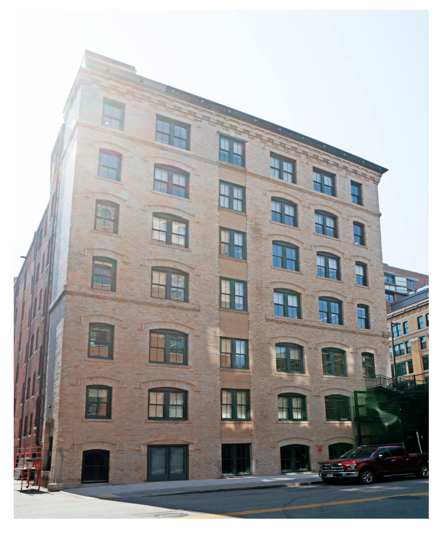
NEW EXTERIOR ELEVATION - OVERALL FACADE