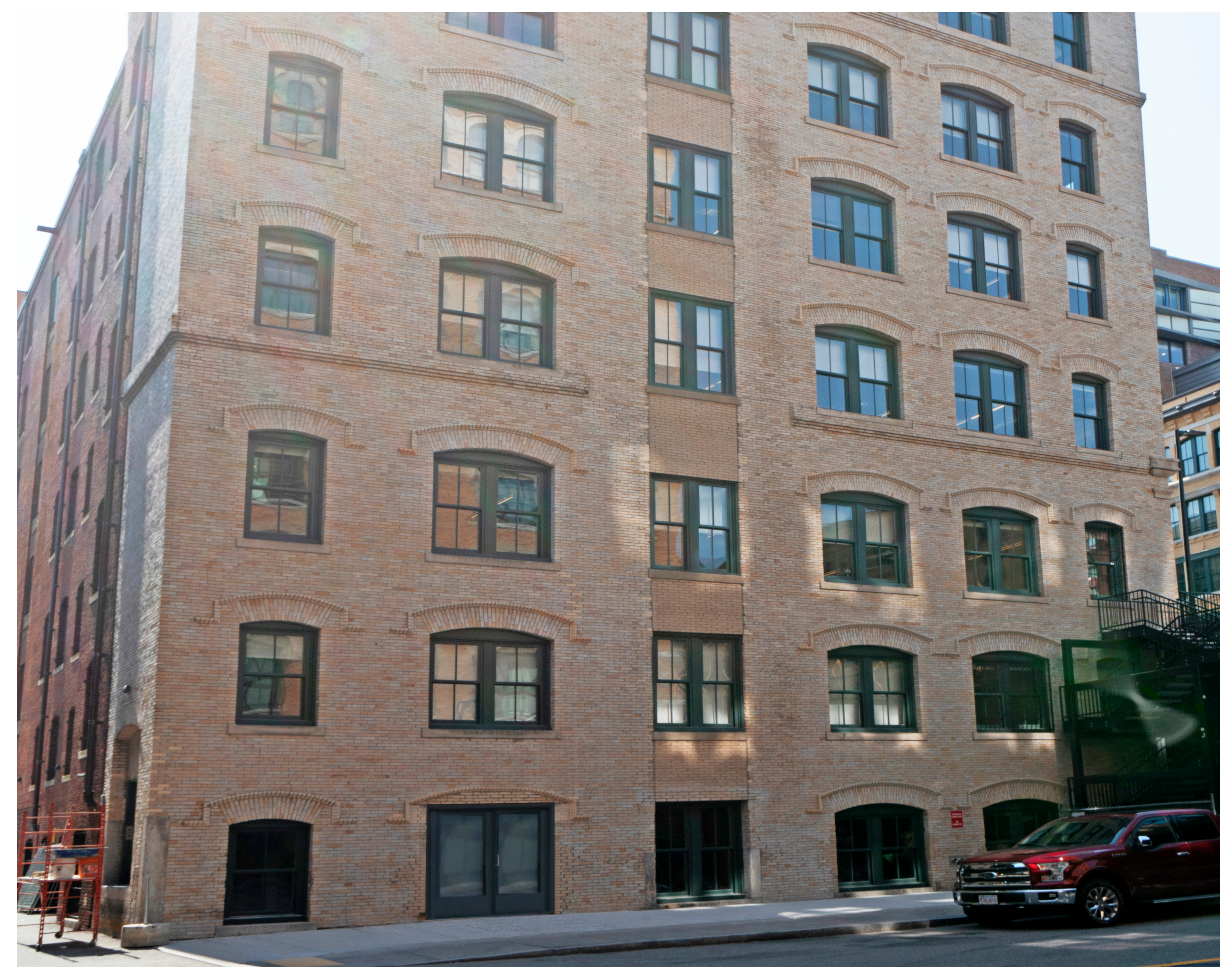
NEW EXTERIOR ELEVATION