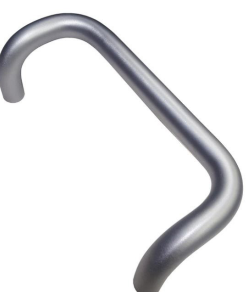
EXTERIOR DOOR PULL (ACTIVE LEAF ONLY)