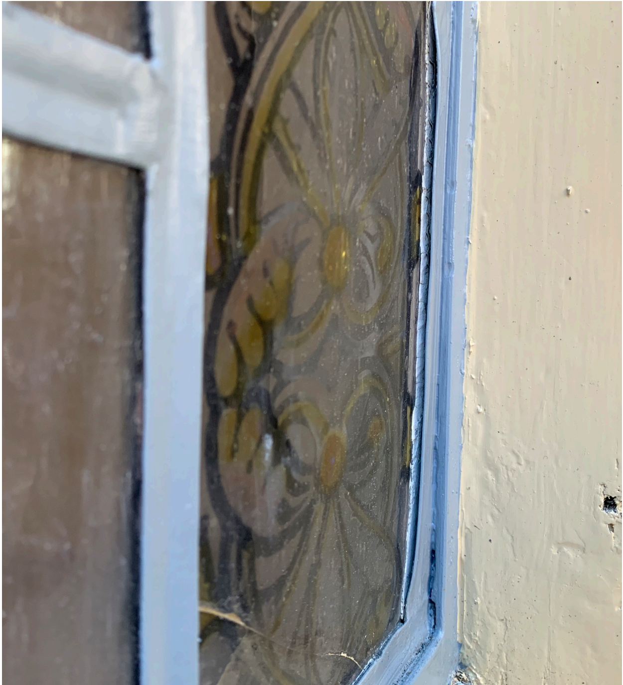
4. DETAIL SHOWING DETERIORATION AT EXISTING LEADED GLASS PANELS