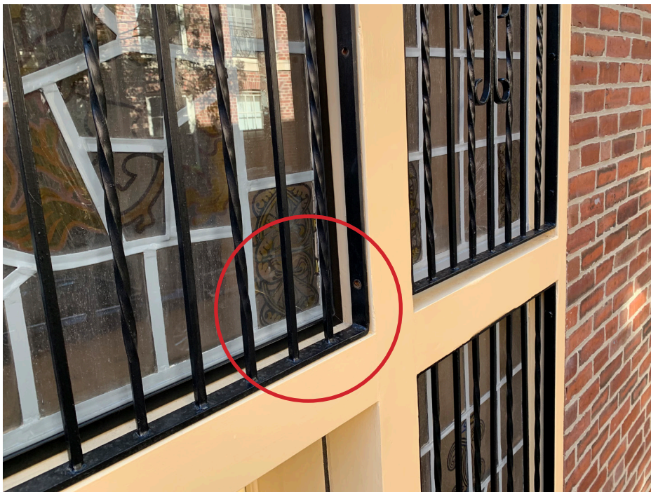
Image of mock-up of proposed panel