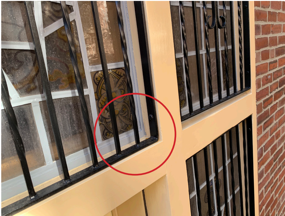
Image of existing condition