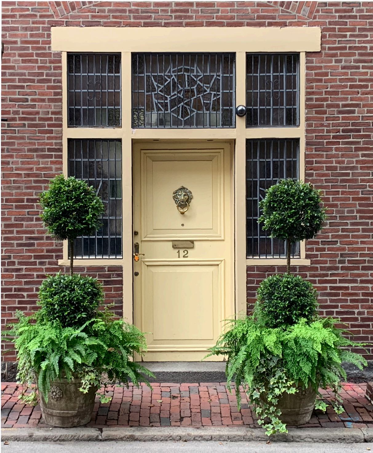
①. EXISTING FRONT ENTRY ELEVATION