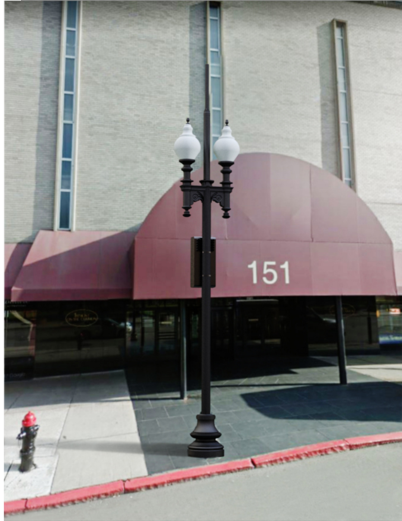
SAMPLE PHOTOGRAPHIC SIMULATION