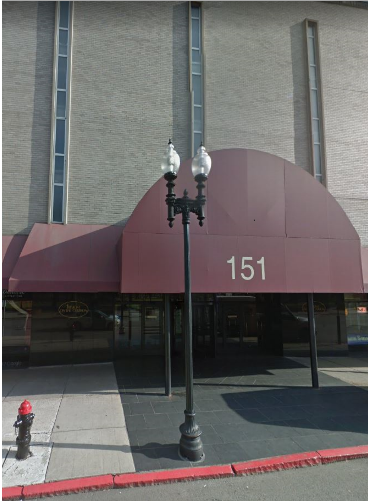
EXISTING PHOTOGRAPHIC VIEW

DRAFTER: SCALE: NTS ISSUE DATE: NODE NAME: SHEET #: 2 OF 2