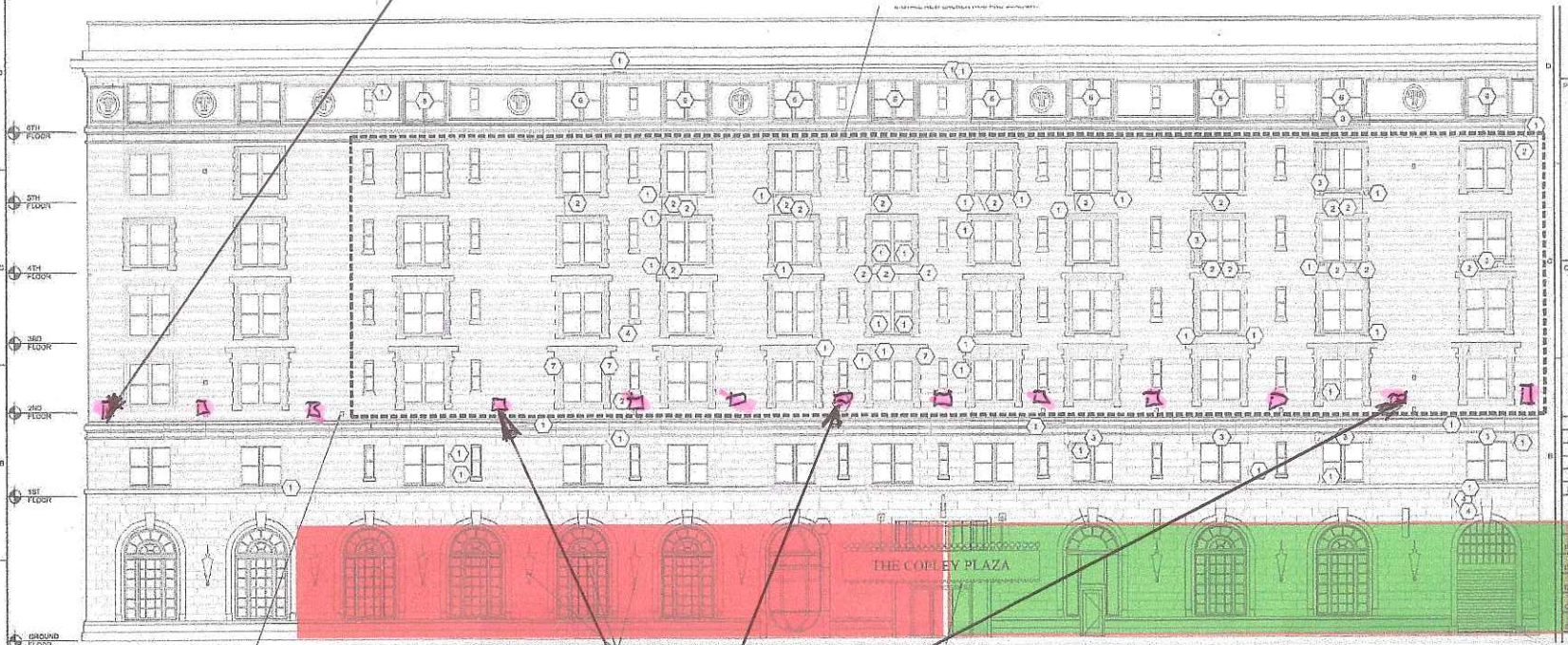
PHOTO TAKEN OF WINDOW LOCATION AT 2W1

PROTECT ALL LIGHT FIXTURES AND FINISHES DURING WORK