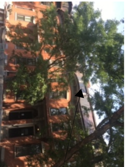
Replace casement windows at front mansard