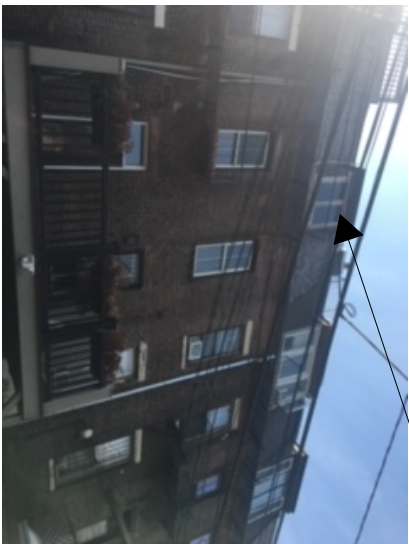
Replace casement windows at rear mansard