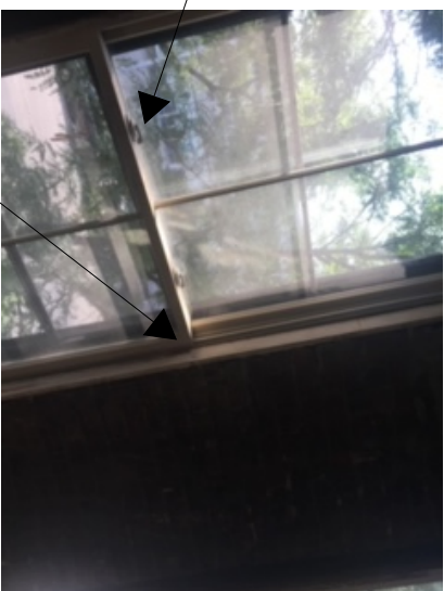
Replace 5 non original windows, 2 at parlor and 3 at 2nd floor. Note jamb liners and sash locks. Street Level windows are the only 2 original windows.