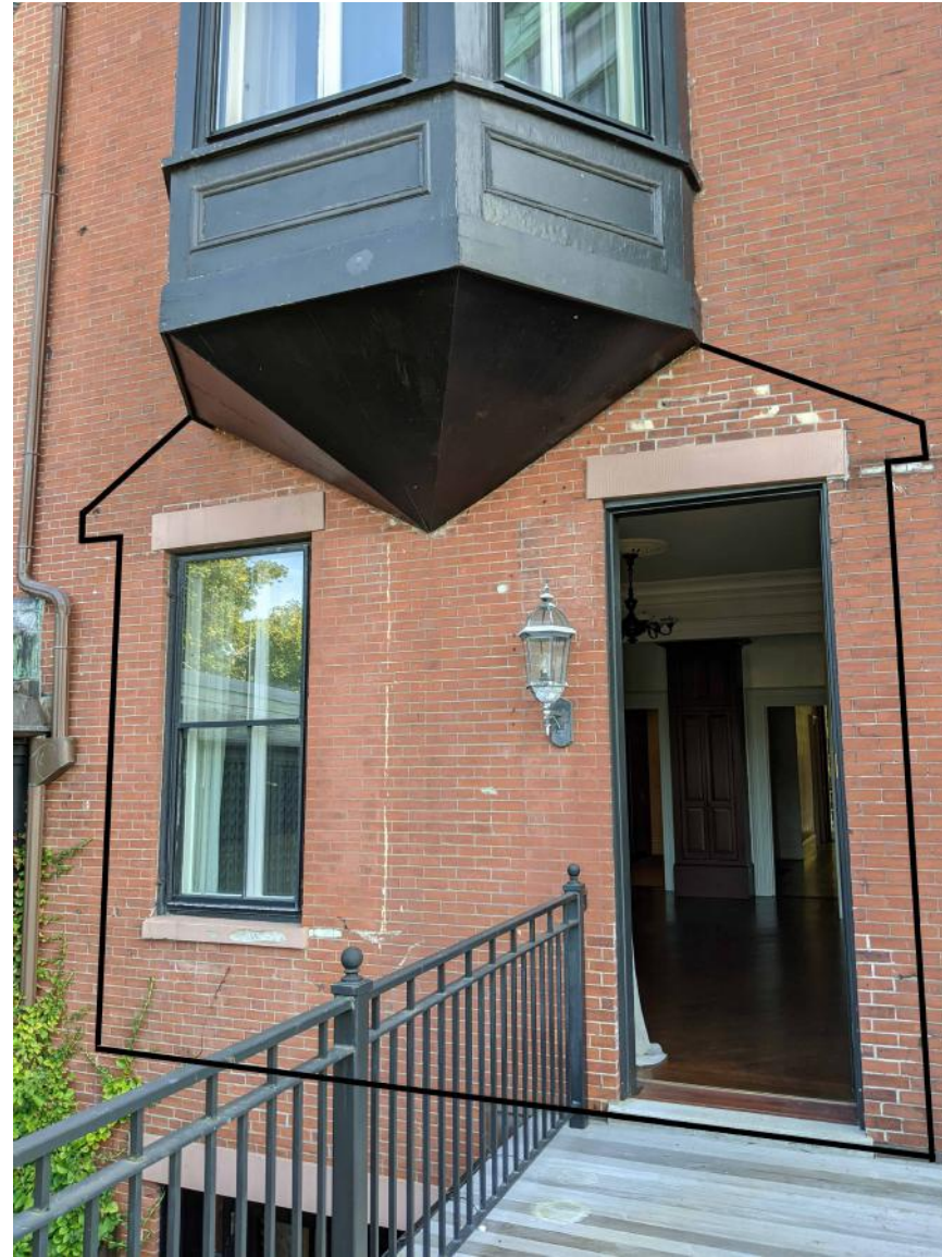
black outline denotes area of brick removal