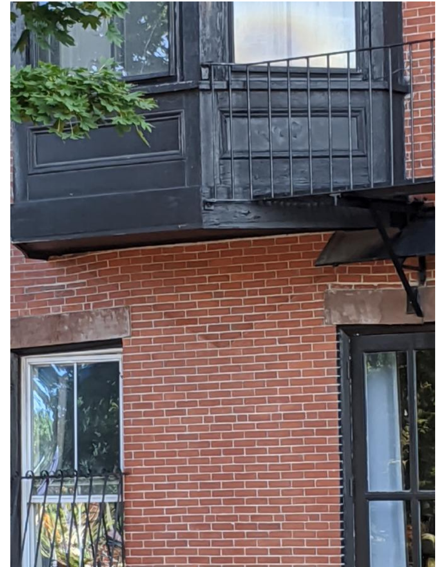
outline of previous lower trim element still visible in discoloration of bricks