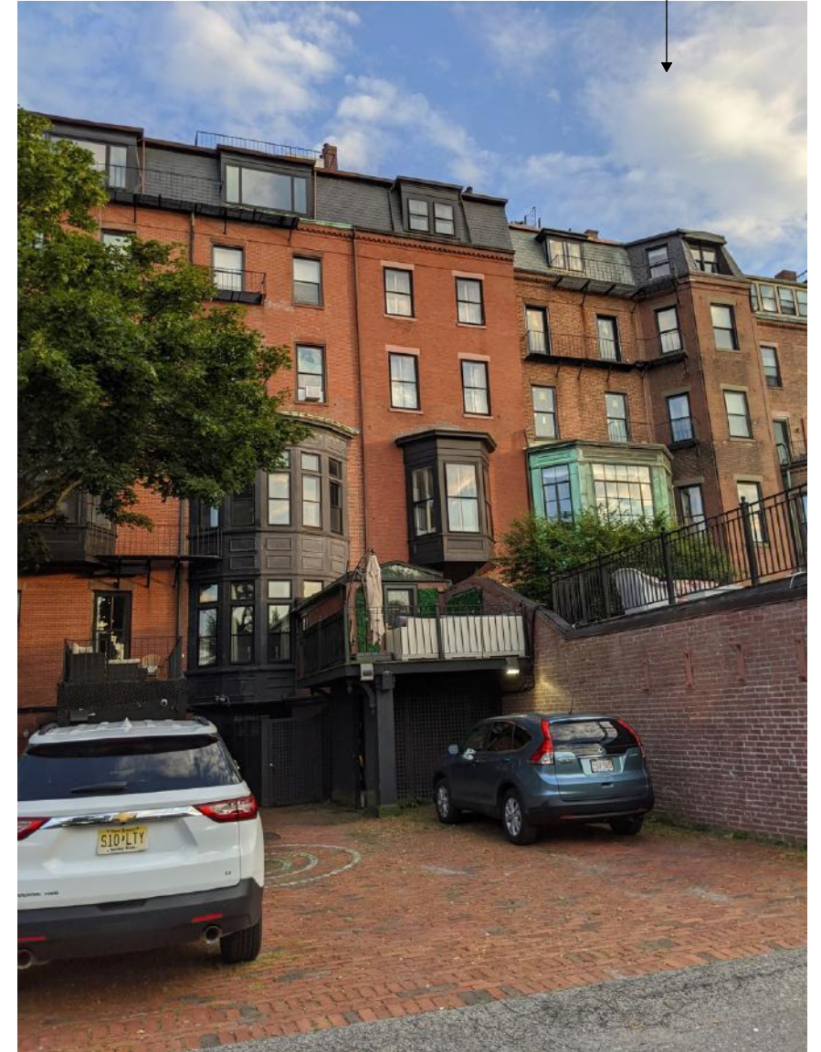
rear elevation view