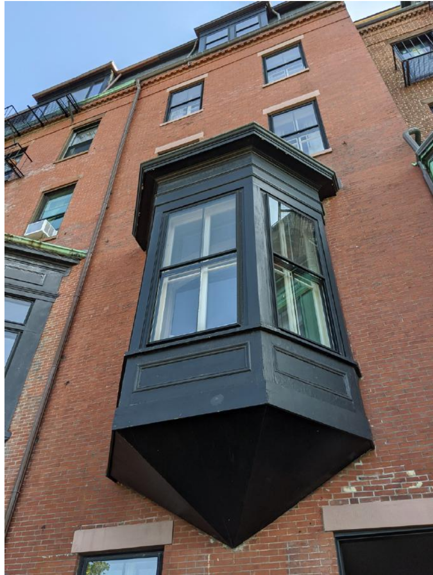
existing oriole, wood exterior painted black