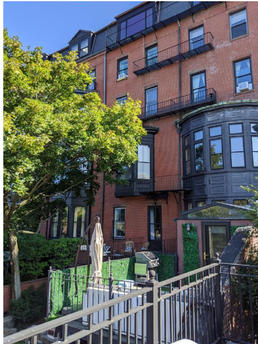
neighboring similar oriole with lower trim removed