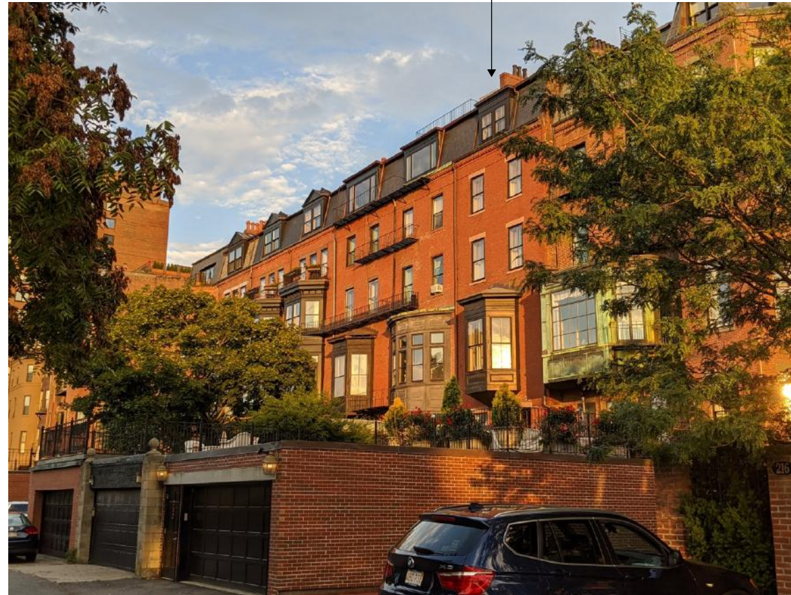
view of neighboring rear facades