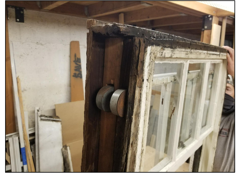
WINDOW #2 PHOTOS