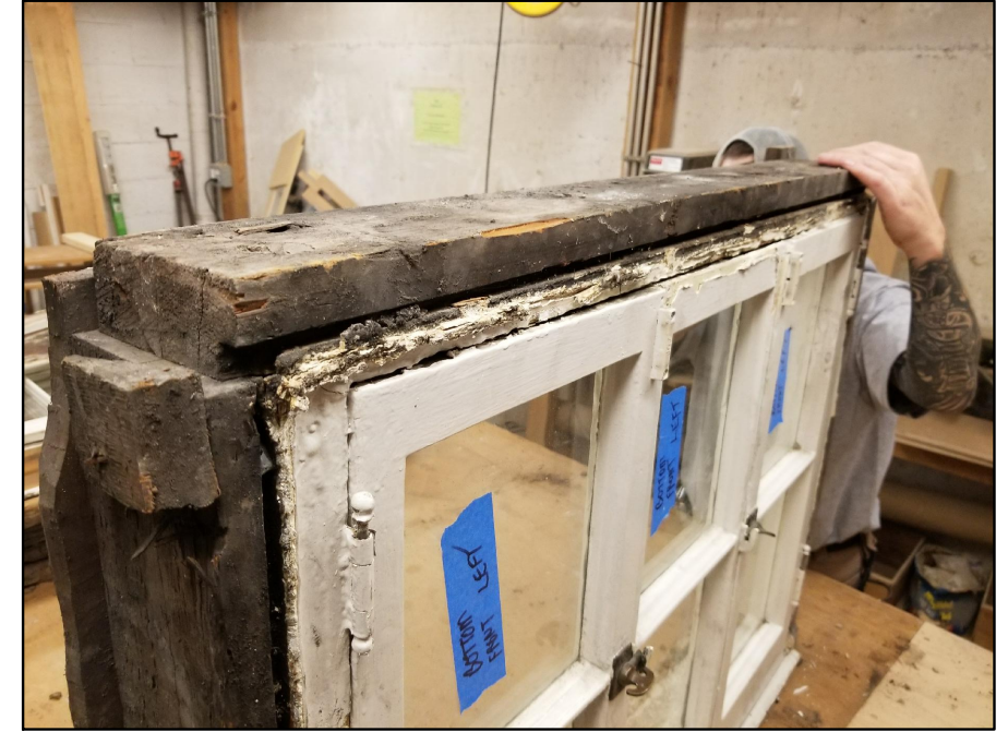
WINDOW #1 PHOTOS