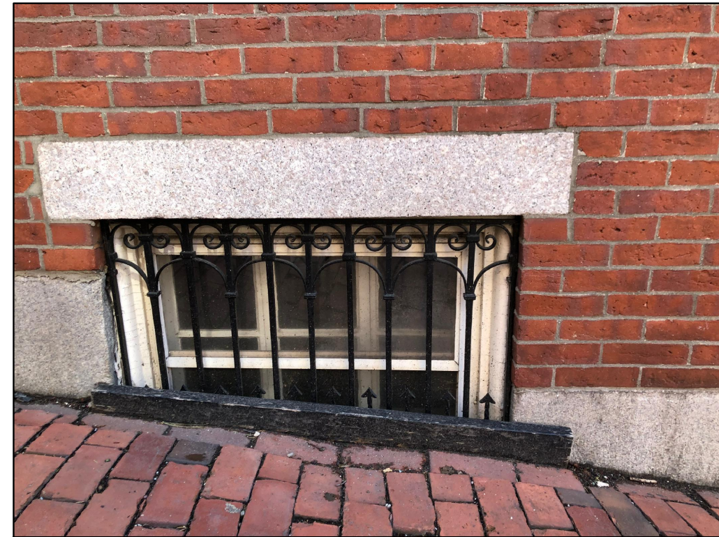
WINDOW #1 CLOSE-UP