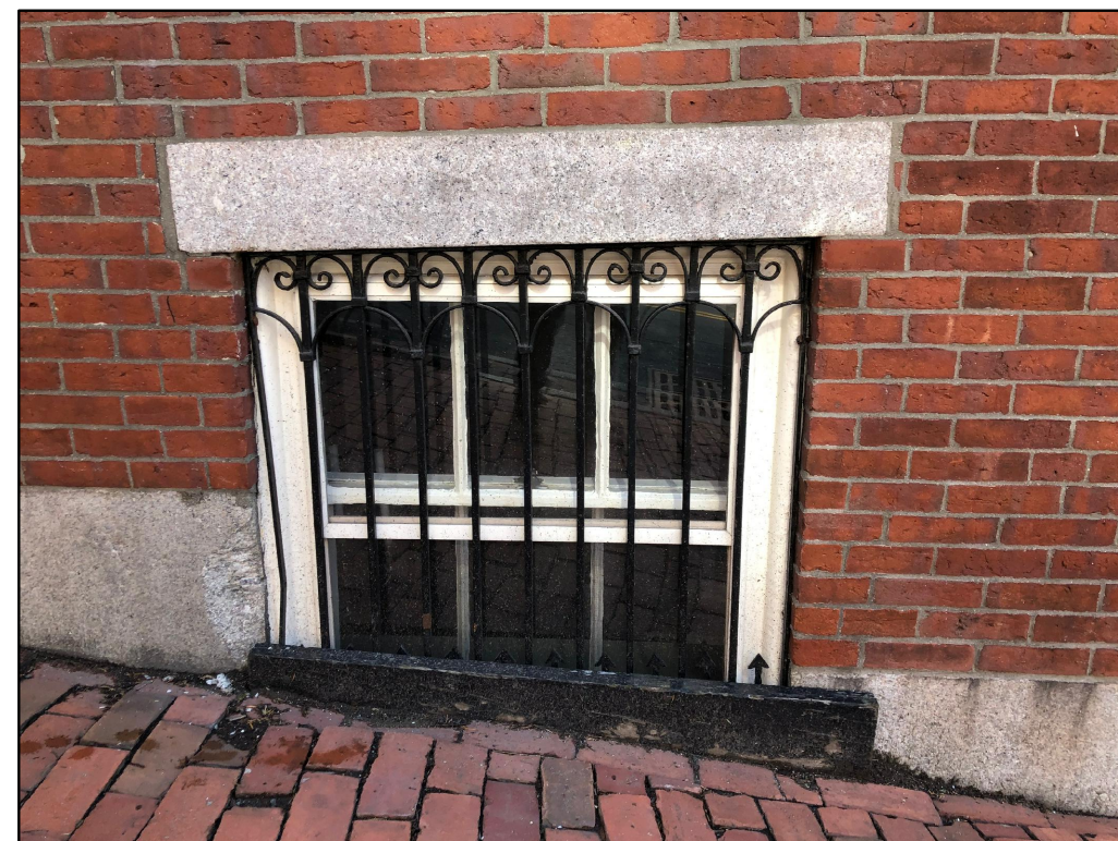
WINDOW #2 CLOSE-UP