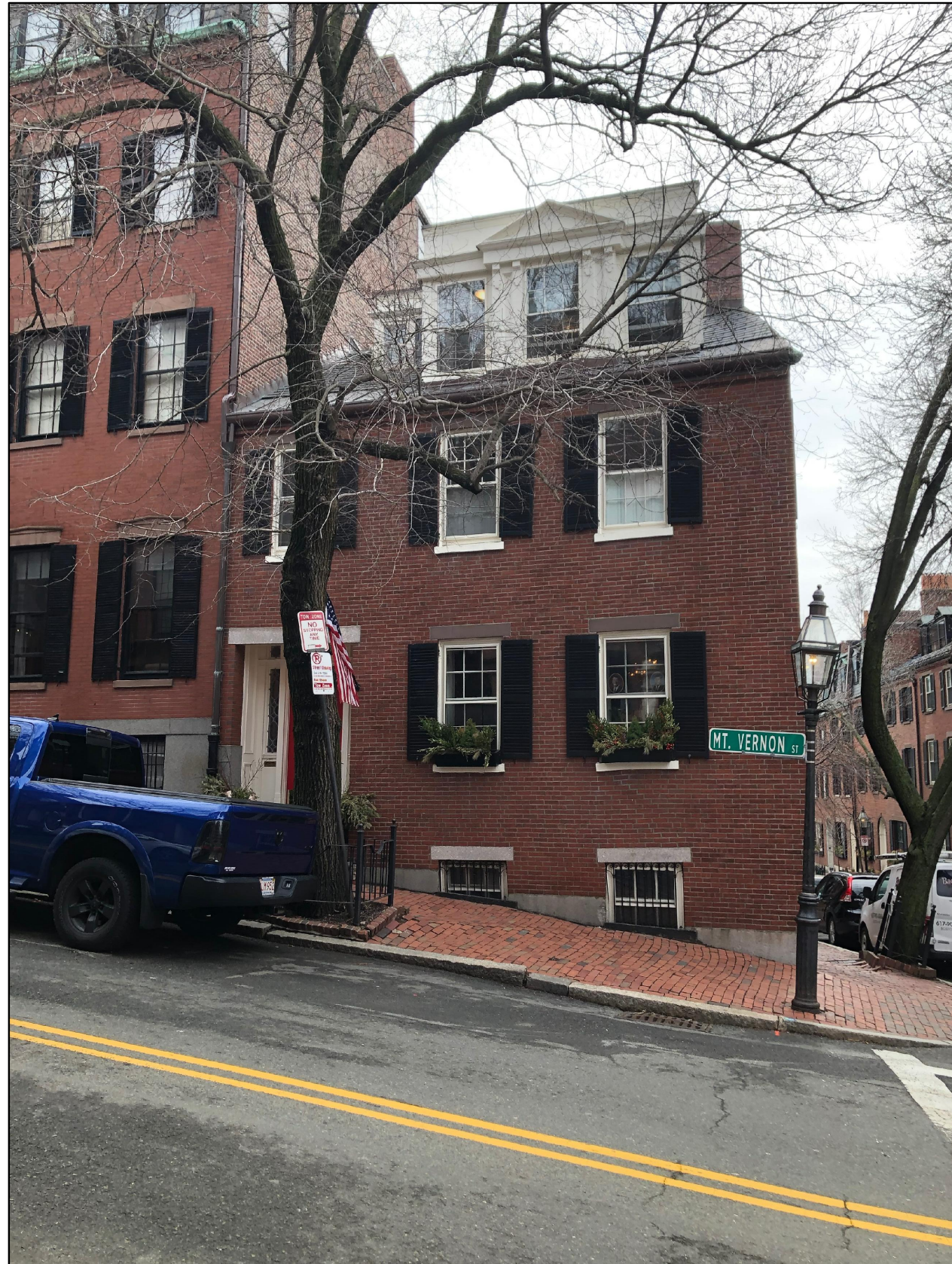
104 MT VERNON, NORTH ELEVATION