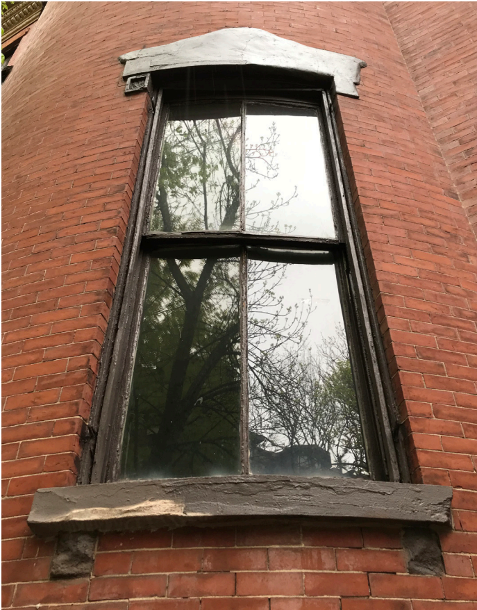
EXTERIOR OF WINDOW