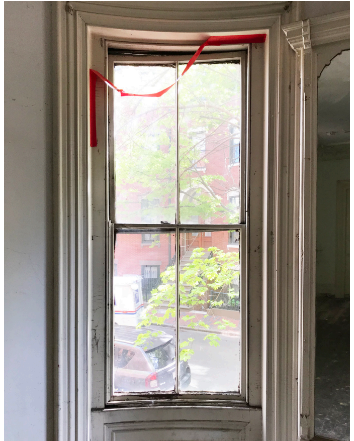
INTERIOR OF WINDOW