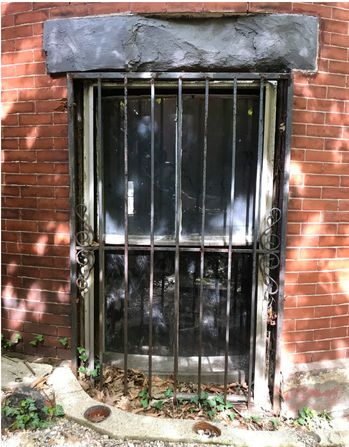
EXTERIOR OF WINDOW