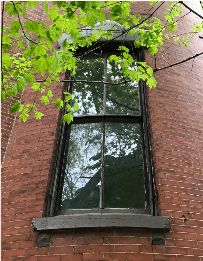
EXTERIOR OF WINDOW