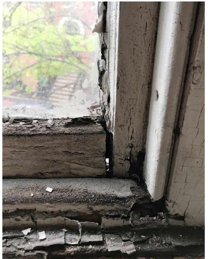
LOWER SASH-BOTTOM CORNER