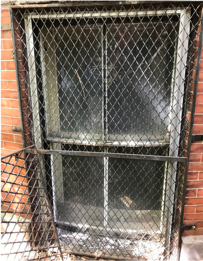
EXTERIOR OF WINDOW