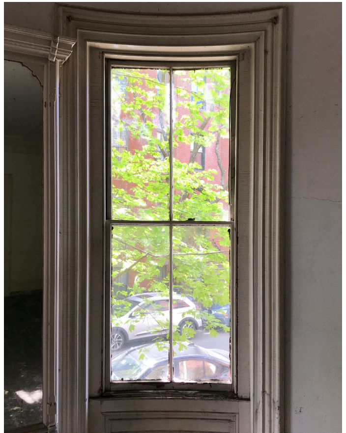
INTERIOR OF WINDOW