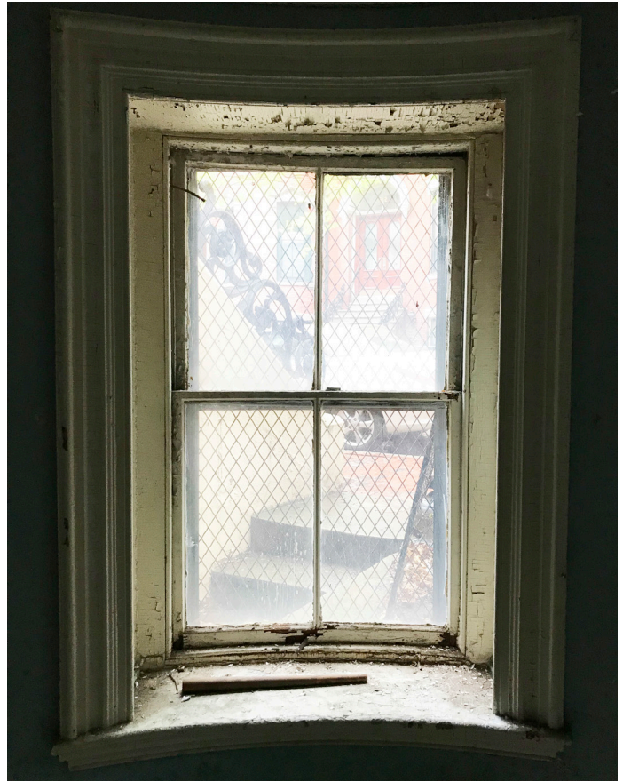
INTERIOR OF WINDOW