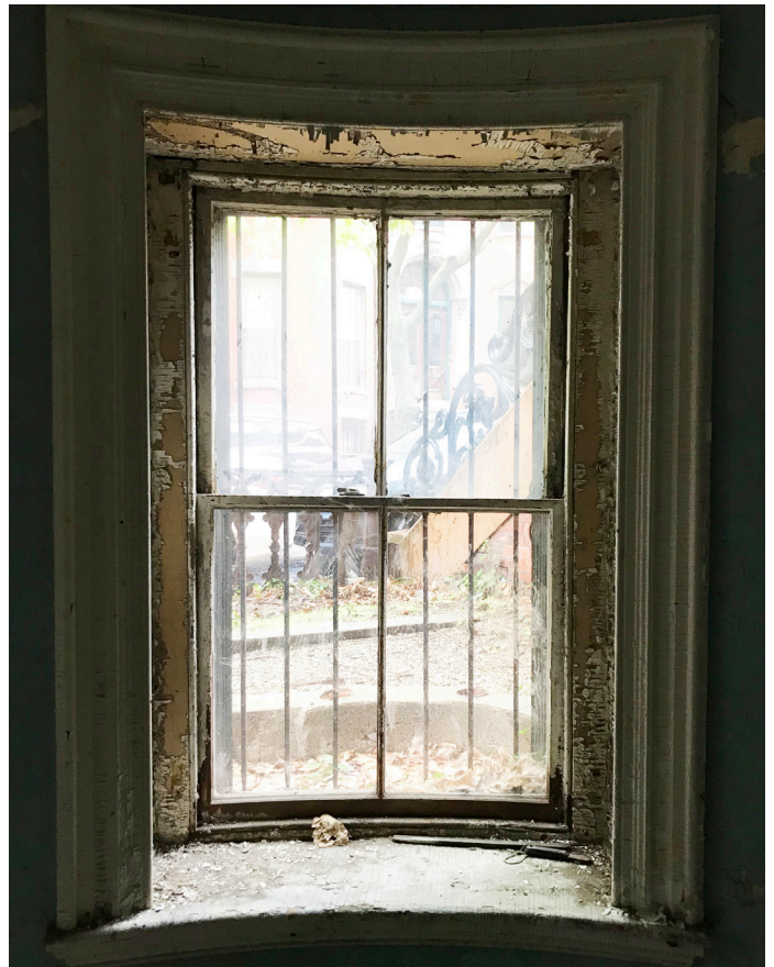
INTERIOR OF WINDOW