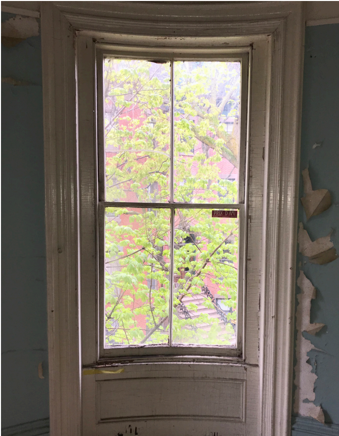
INTERIOR OF WINDOW