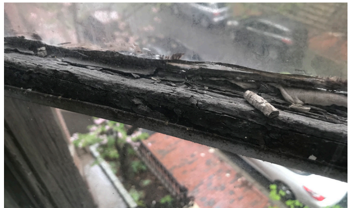
BOTTOM RAIL-TOP SASH