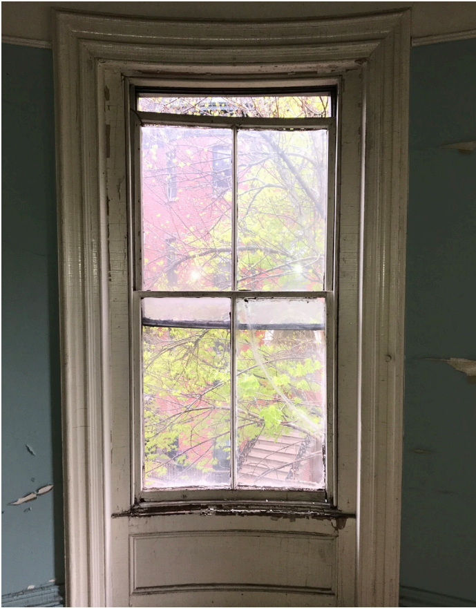
INTERIOR OF WINDOW