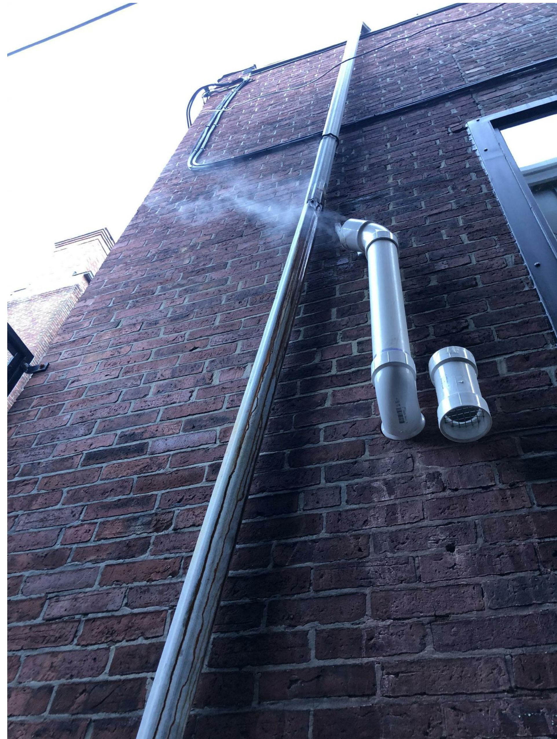
1 EXISTING EXHAUST 1 1/2" = 1'-0"