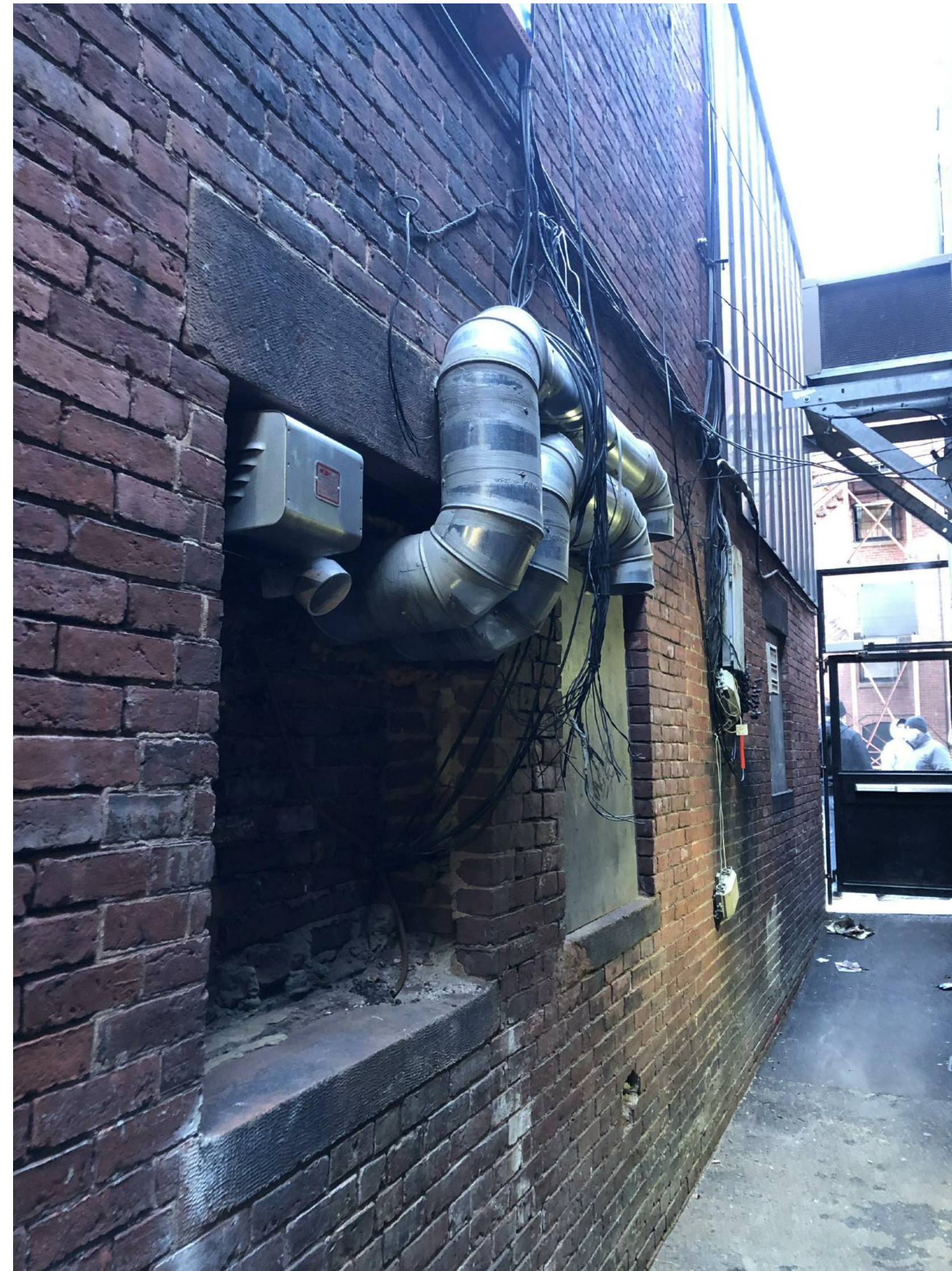
2 EXISTING ALLEY 2 1 1/2" = 1'-0"