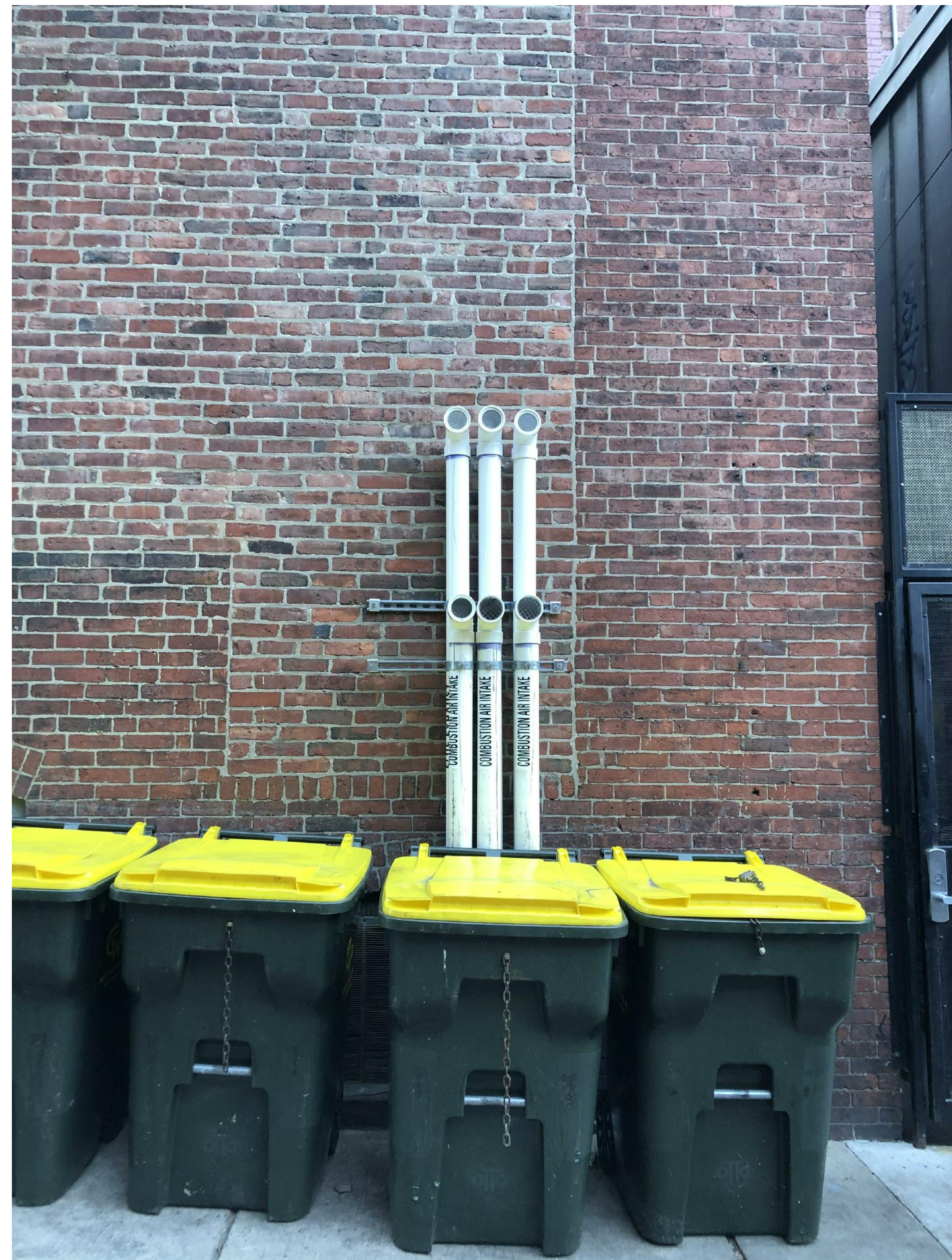
1 EXISTING EXHAUST VENTS 1 1/2" = 1'-0"