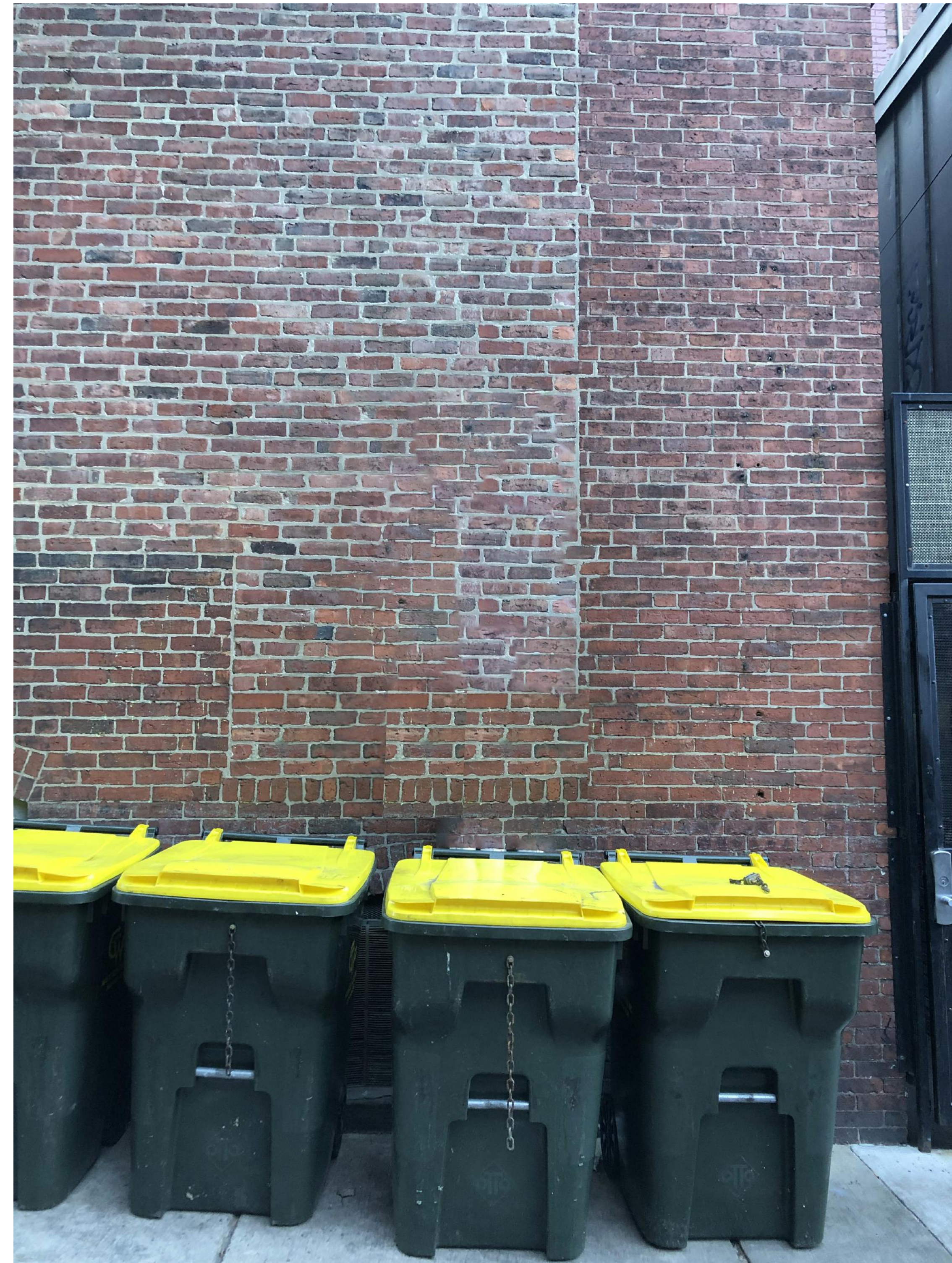
2 PROPOSED EXHAUST REMOVAL 1 1/2" = 1'-0"