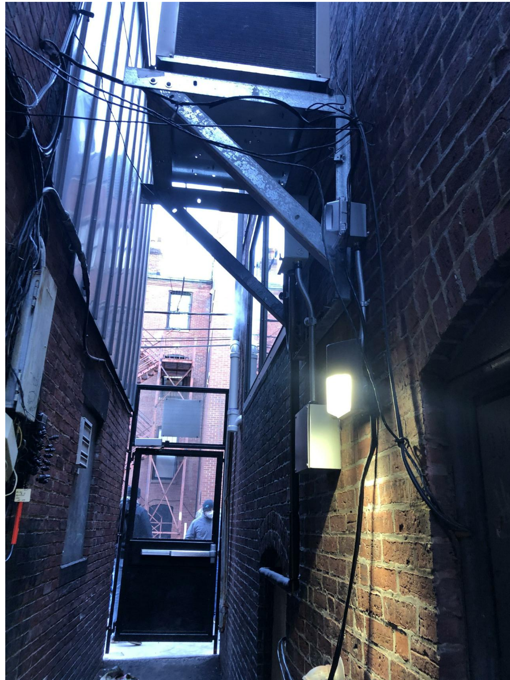
1 EXISTING ALLEY 1 1 1/2" = 1'-0"