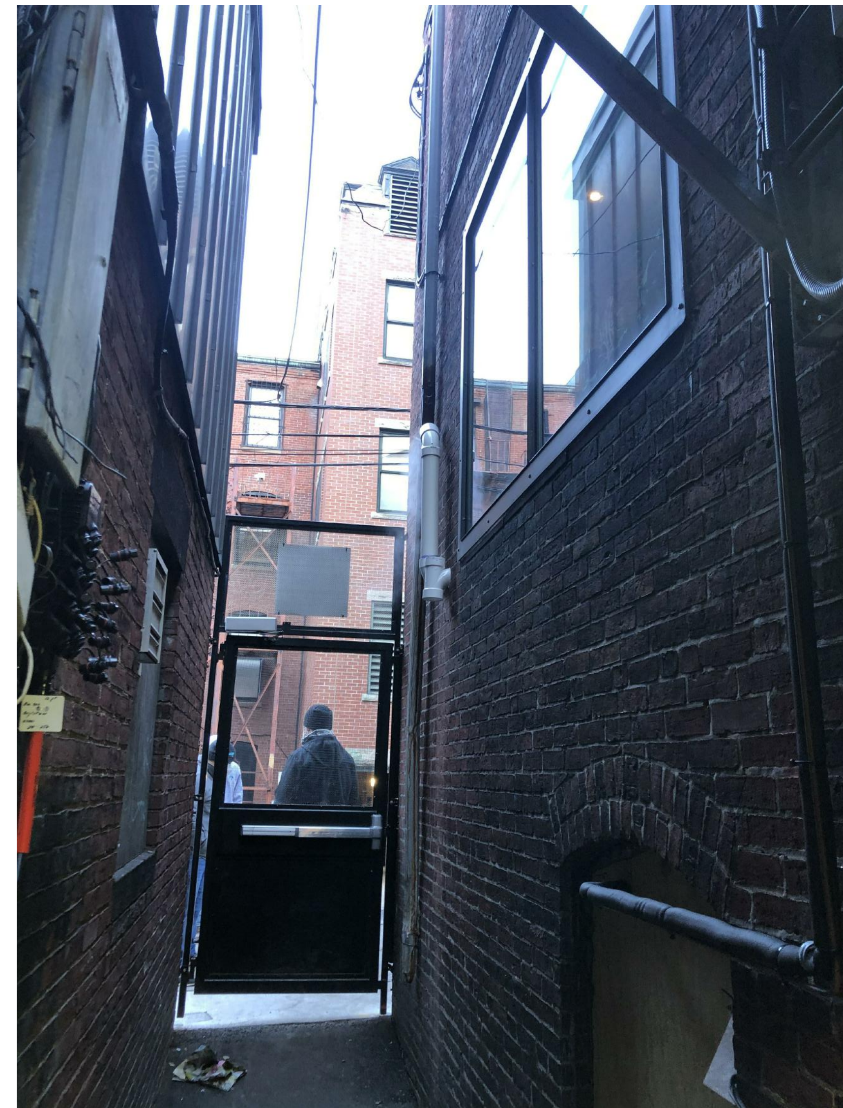
3 EXISTING ALLEY 3 1 1/2" = 1'-0"