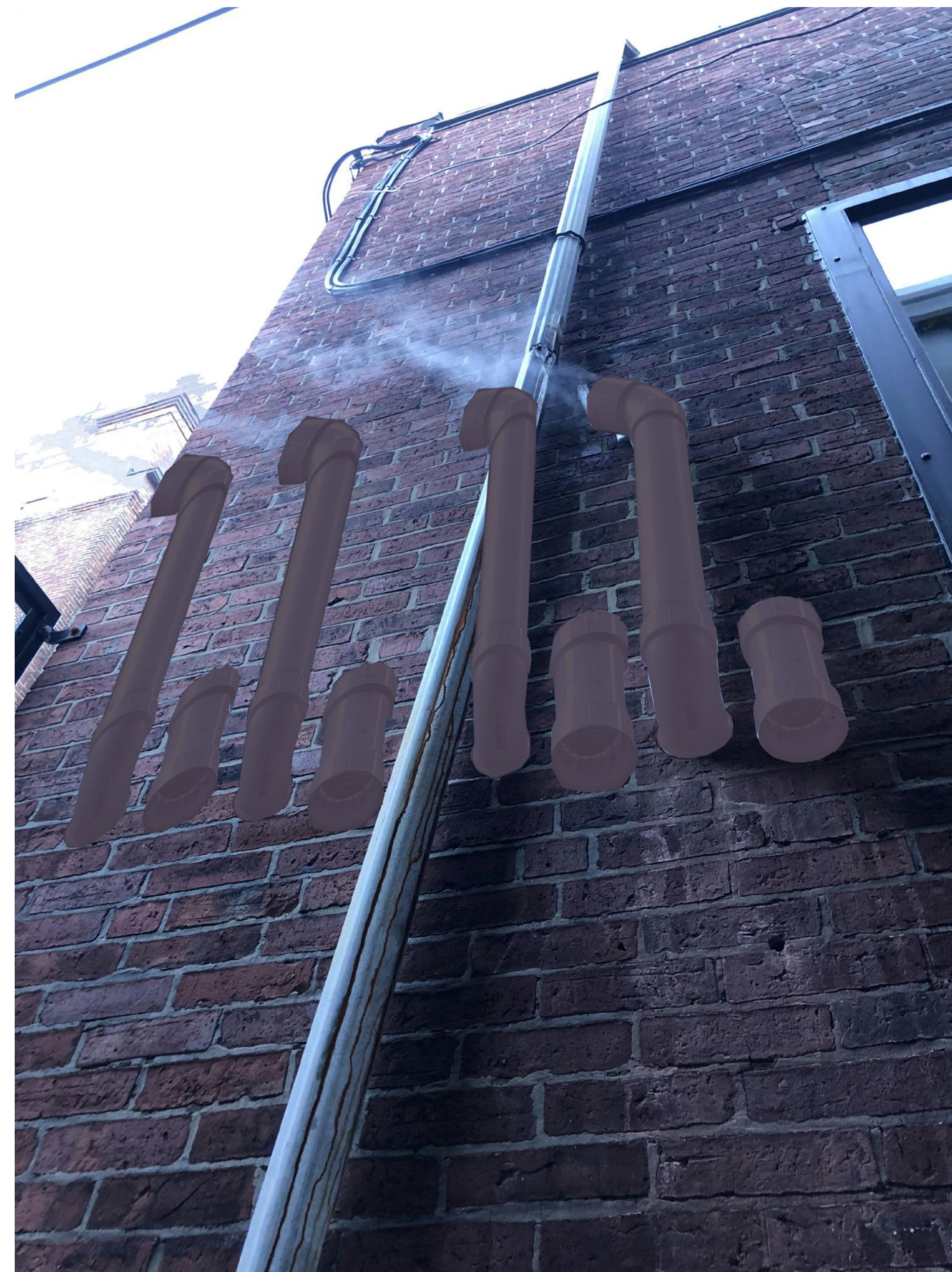
2 PROPOSED EXHAUST ADDITIONS 1 1/2" = 1'-0"