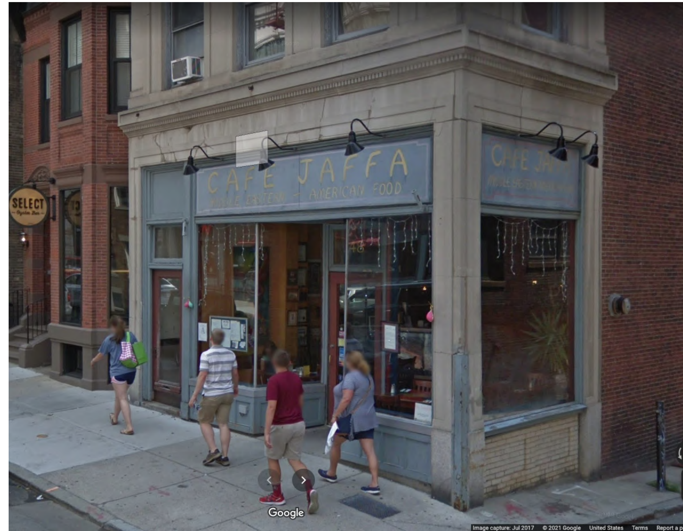
3 PRE-RENOVATION (2017) 1 1/2" = 1'-0"