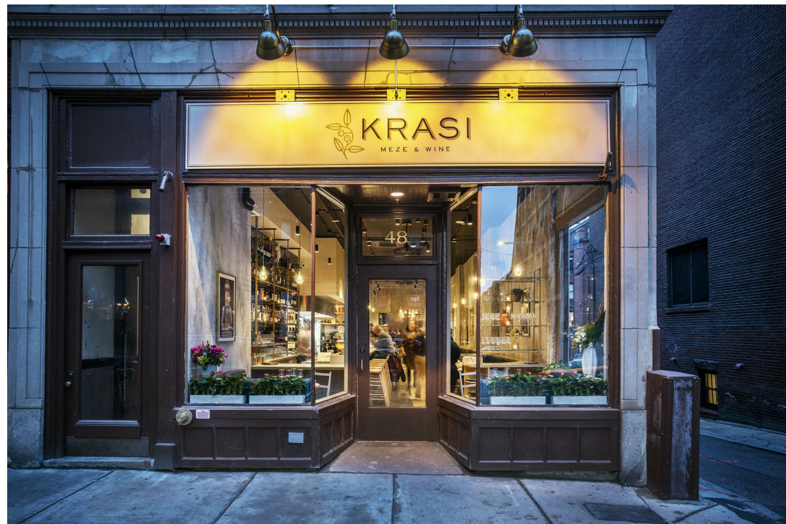
1 EXISTING FRONT FACADE 1 1/2" = 1'-0"