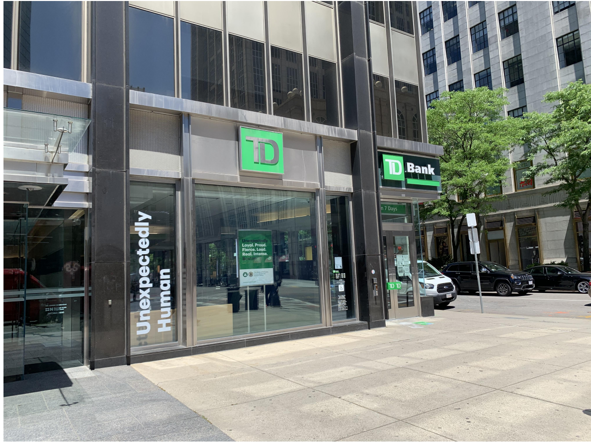
BOYLSTON ST. ELEVATION - FROM LEFT