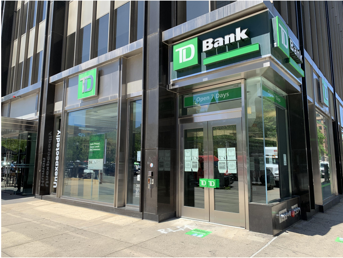
BOYLSTON ST. ELEVATION - FROM RIGHT