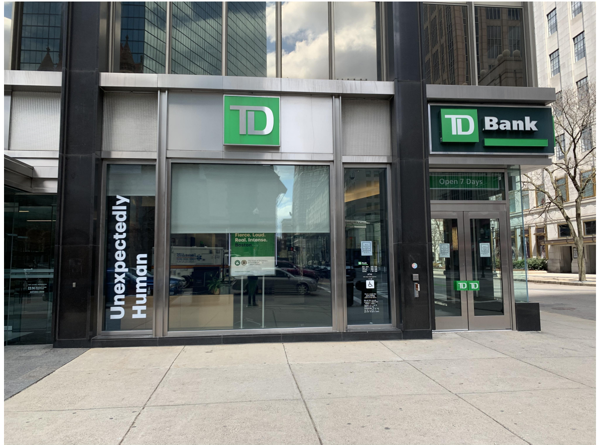
BOYLSTON ST. ELEVATION - HEAD-ON