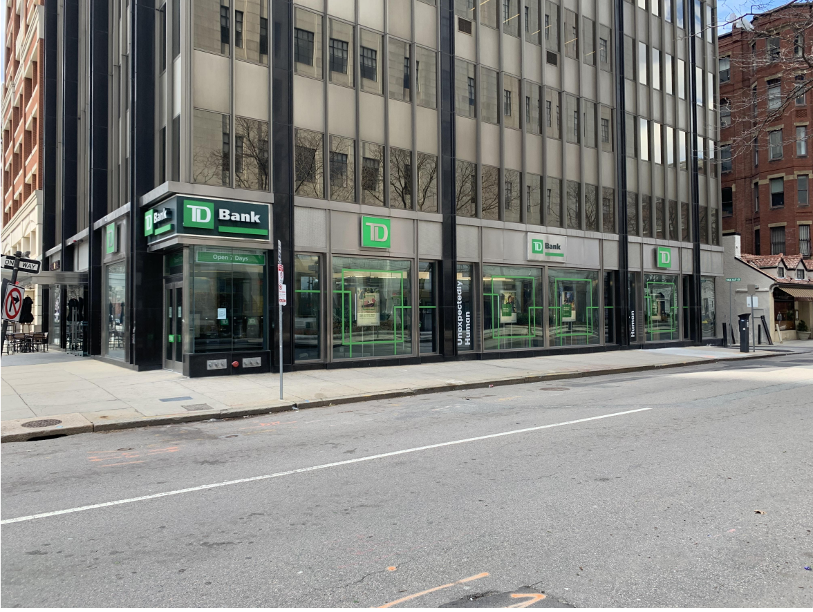
CLARENDON ST. ELEVATION - FROM OPPOSITE CORNER