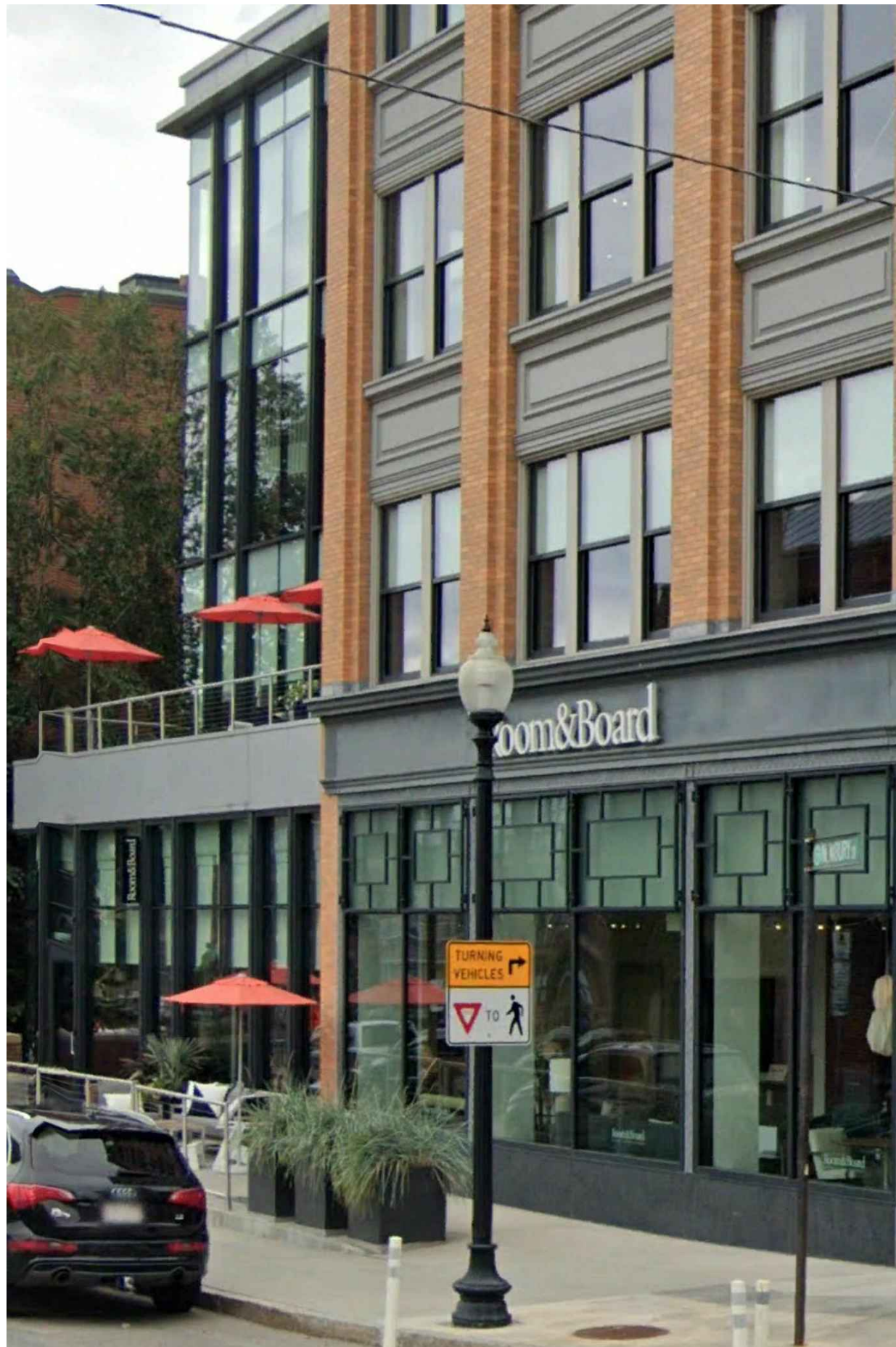
EXISTING PHOTOGRAPHIC VIEW