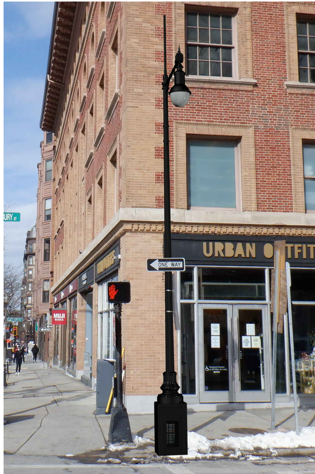
PROPOSED PHOTOGRAPHIC SIMULATION