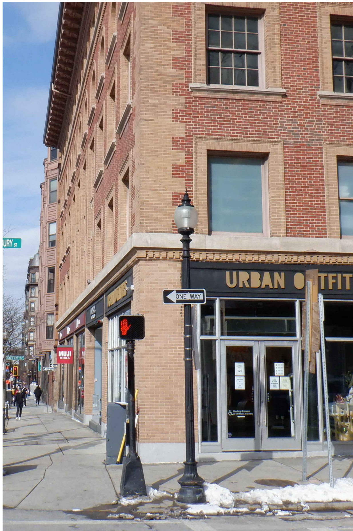
EXISTING PHOTOGRAPHIC VIEW