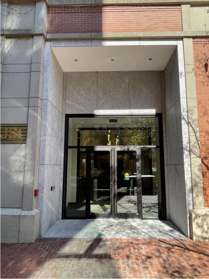
Actual Progress Main Entrance