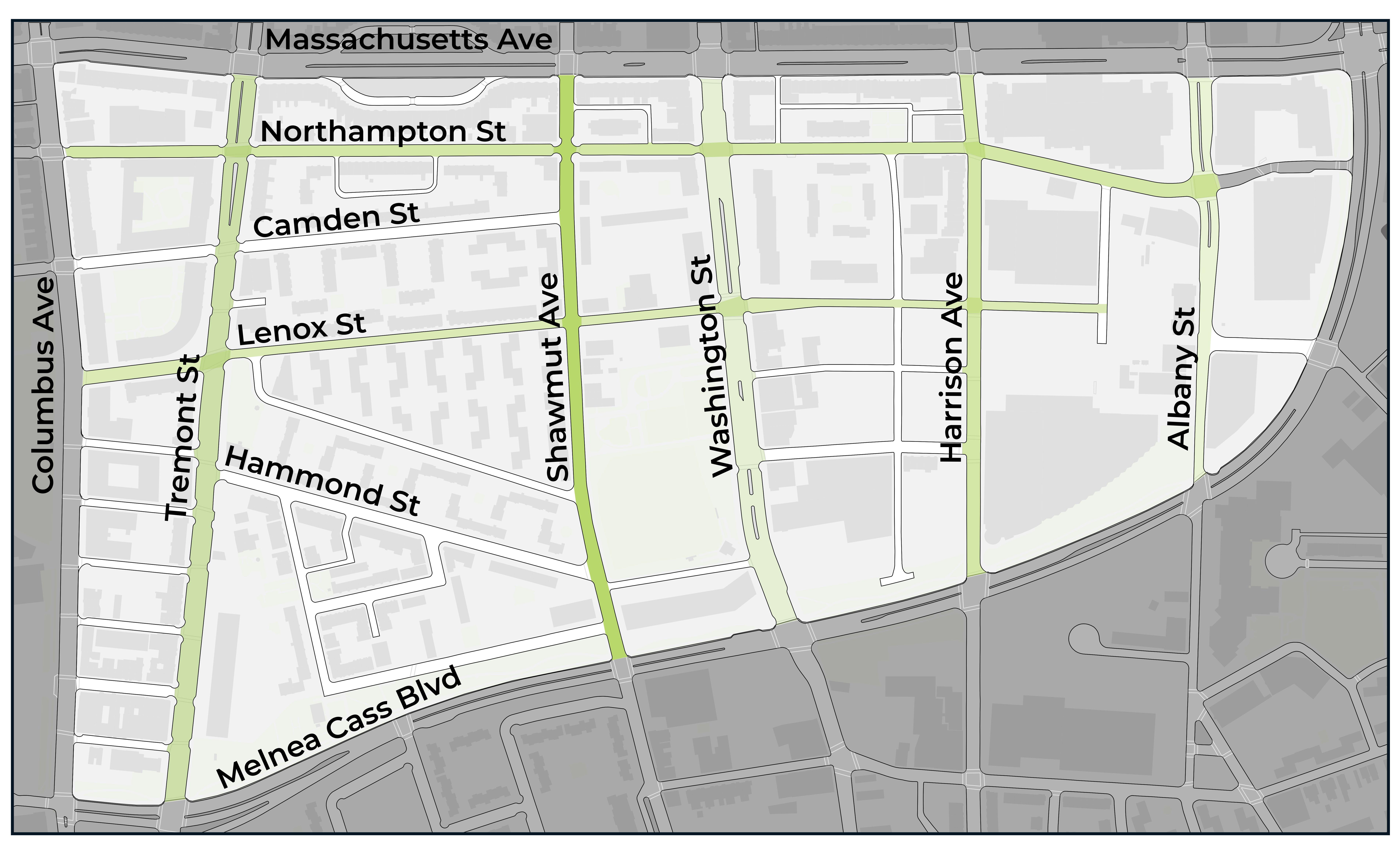
Safer biking along corridors

The darker the green, the more comments we've received about the street