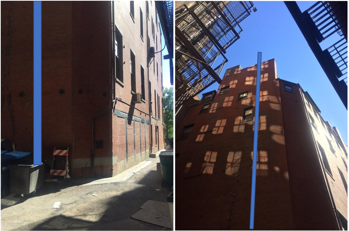
The location of the proposed chimney is illustrated (in blue) on these photographs of the rear wall of 8 Park Street, taken from point A , as noted on the plan shown on the previous page.