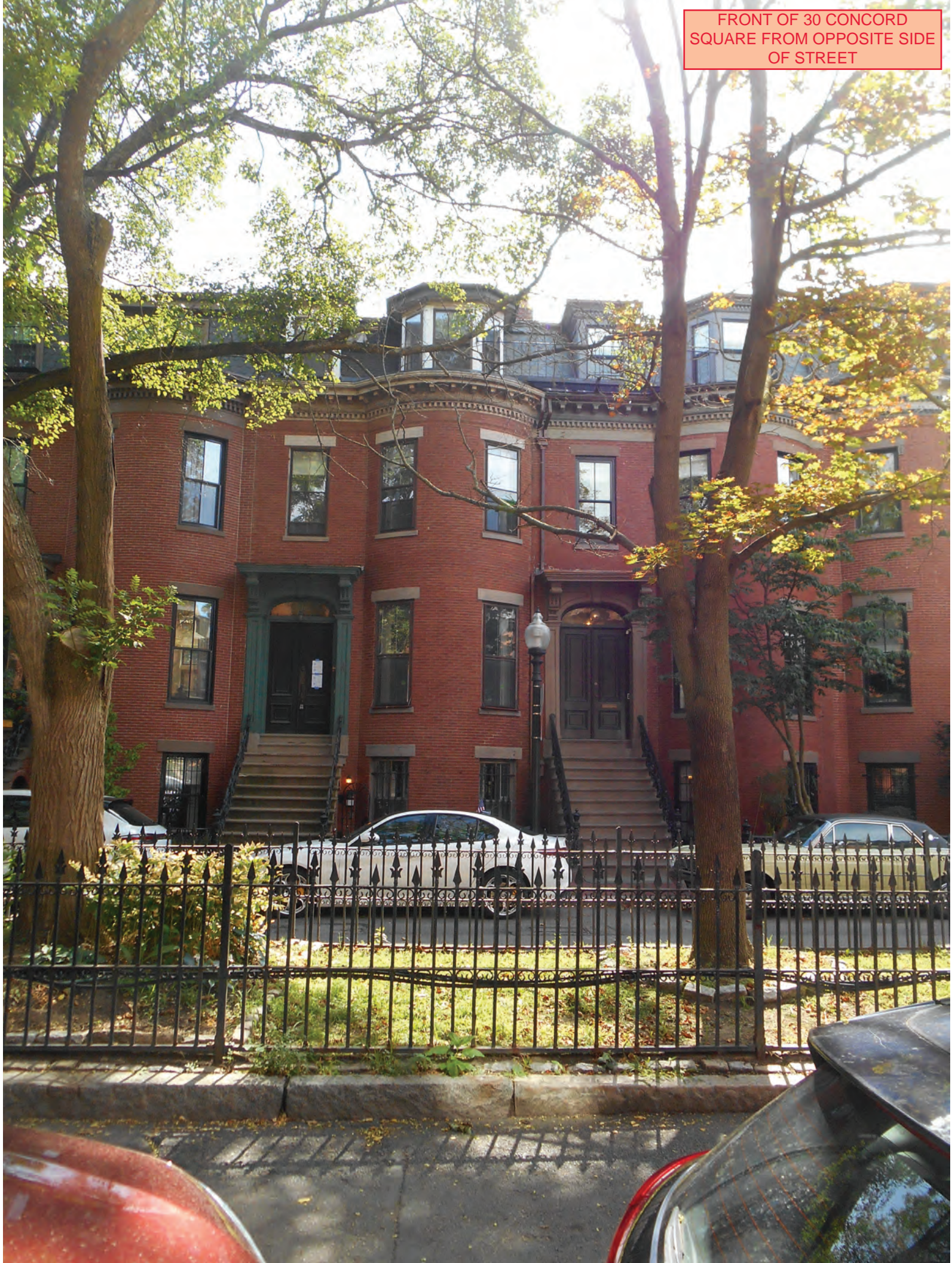
FRONT OF 30 CONCORD SQUARE FROM OPPOSITE SIDE OF STREET