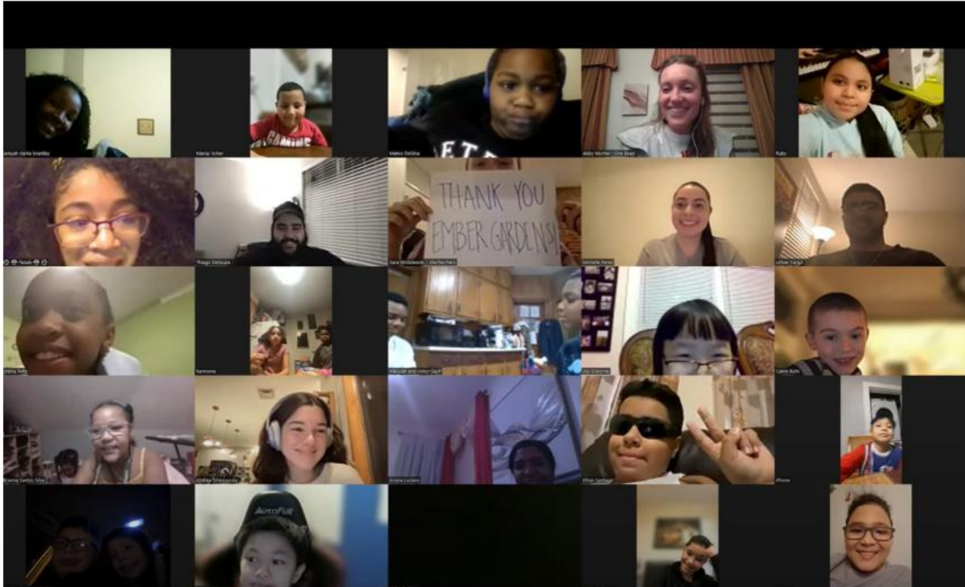
Our students were so excited to hear that Ember Gardens is sponsoring future programming!