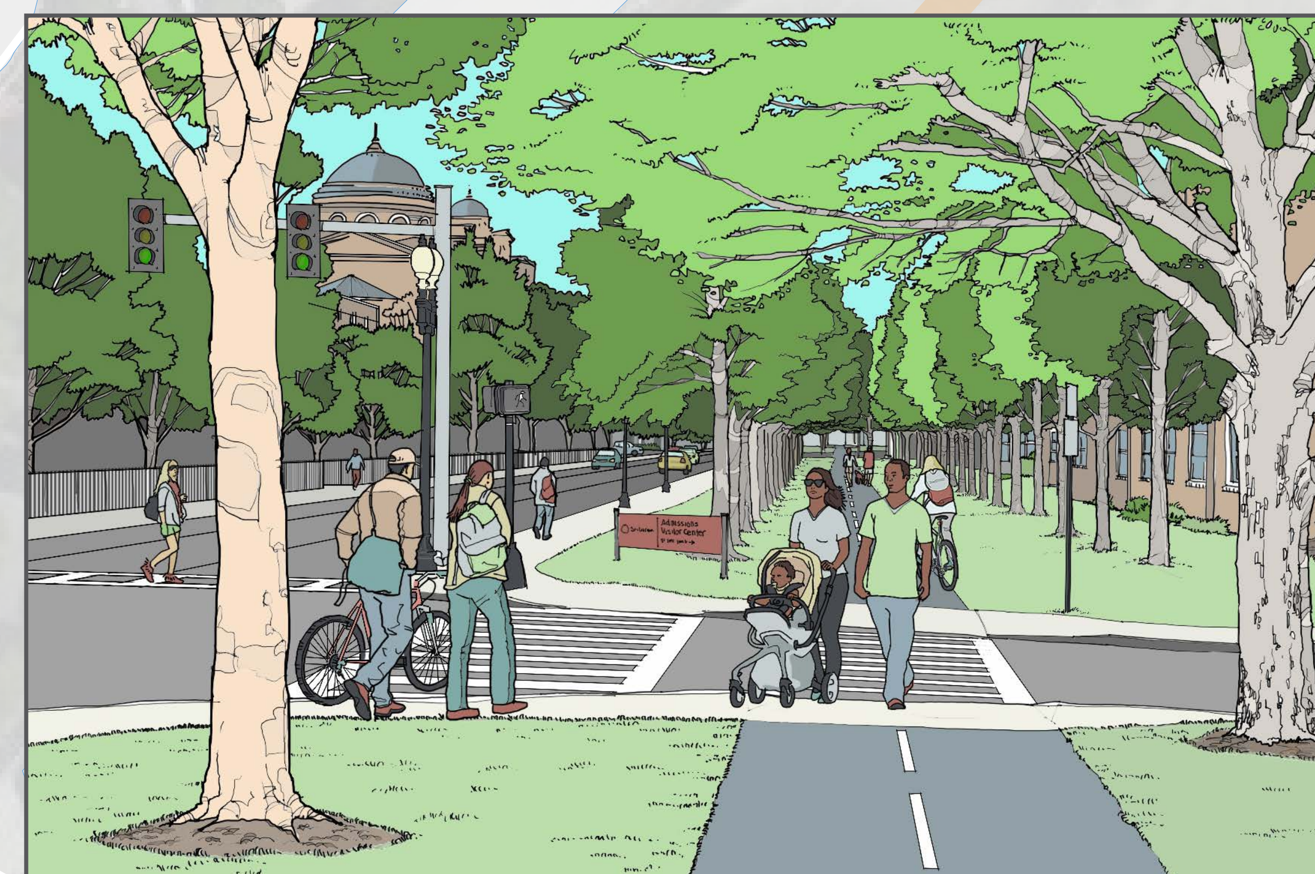
View of proposed off-street shared use path along Ruggles St (Image Credit: Lawrence and Lillian Solomon Foundation and NBBJ)

Off-street shared-use path along Ruggles St