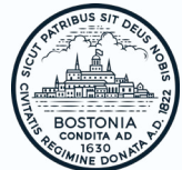
Mayor Michelle Wu

A handwritten signature in black ink that reads "Michelle Wu".