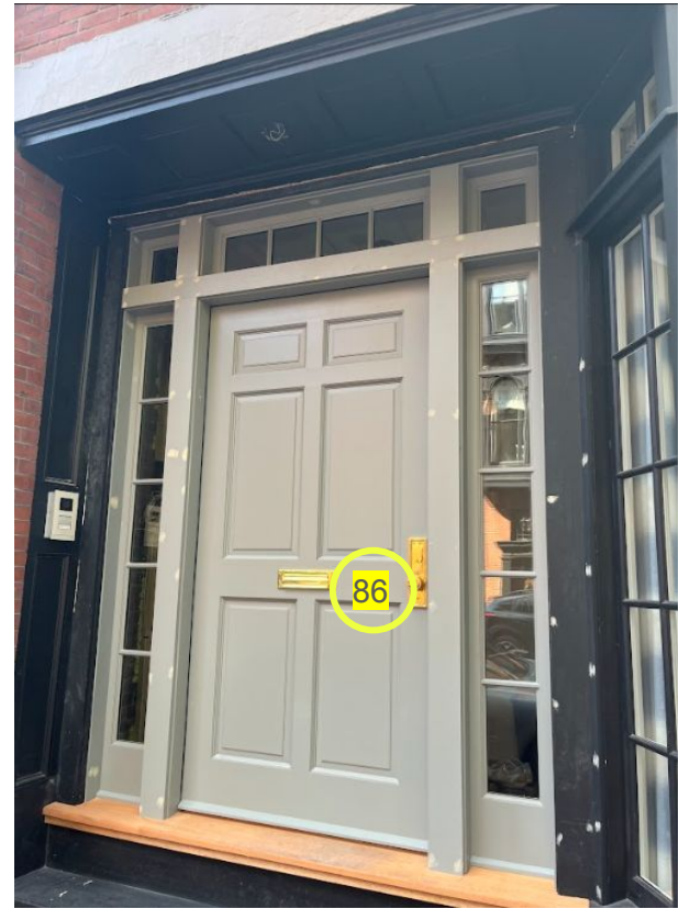
PROPOSED ADDRESS NUMBER PLACEMENT ON NEW DOOR