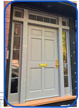
NEW DOOR 4.27