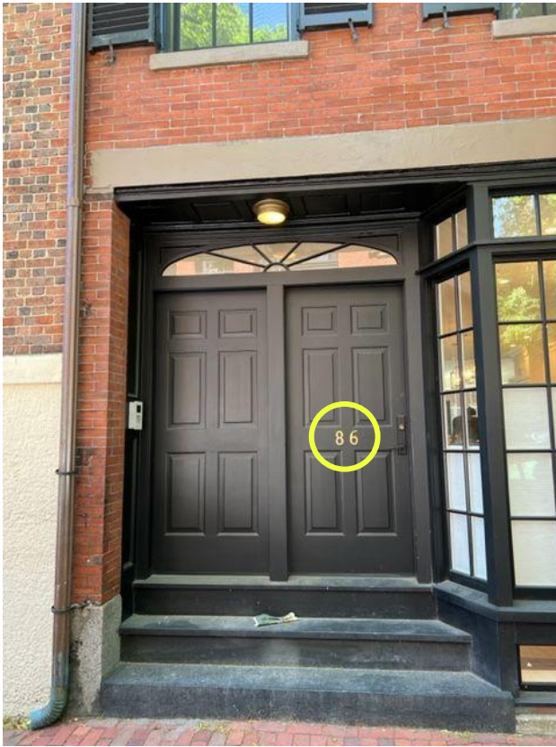
EXISTING ADDRESS NUMBER PLACEMENT