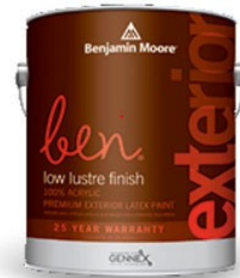
Benjamin Moore ben Exterior Latex Paint Low Lustre Finish (542)

Cleanup: Soap and Water Resin Type: 100% Acrylic Latex Recommended Use: Exterior MPI Rating: 15 VOC Level: 45.0