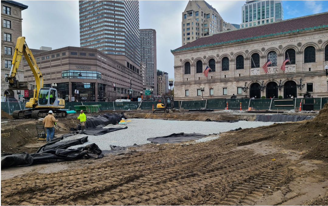
And done! The area has been filled with gravel - we are going to put our plaza area above.