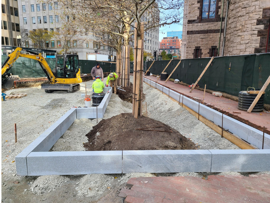
The curb being installed around the 4 London Plane trees by Trinity Church. You can see where the benches will be recessed into the planter, on the left.