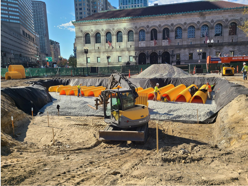
The infiltration chamber in process...