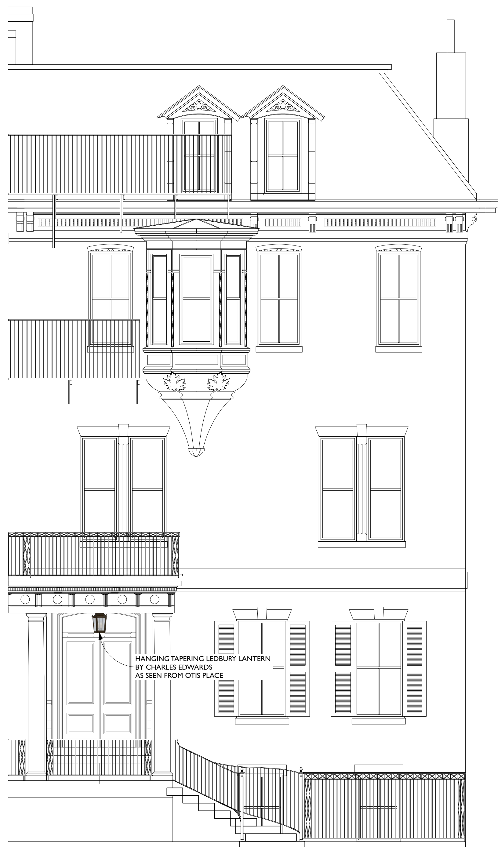
1 SOUTH ELEVATION Scale: 1/4" = 1'-0"