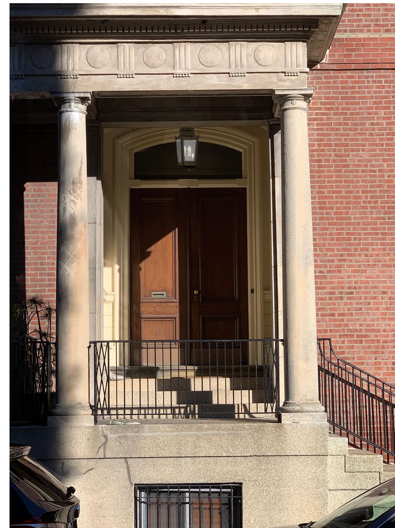
VIEW FROM OTIS PLACE - PRIVATE WAY