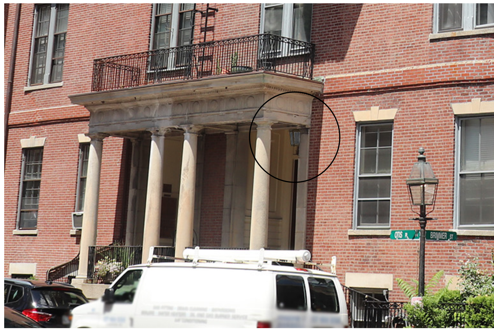
ZOOMED IN VIEW FROM BRIMMER STREET - PUBLIC WAY