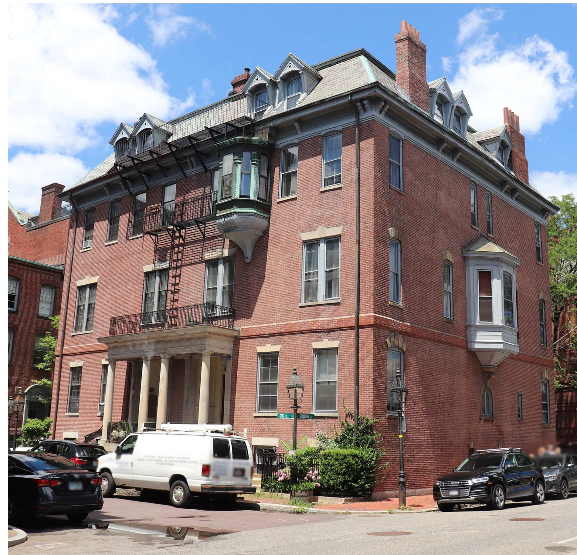
VIEW FROM BRIMMER STREET - PUBLIC WAY