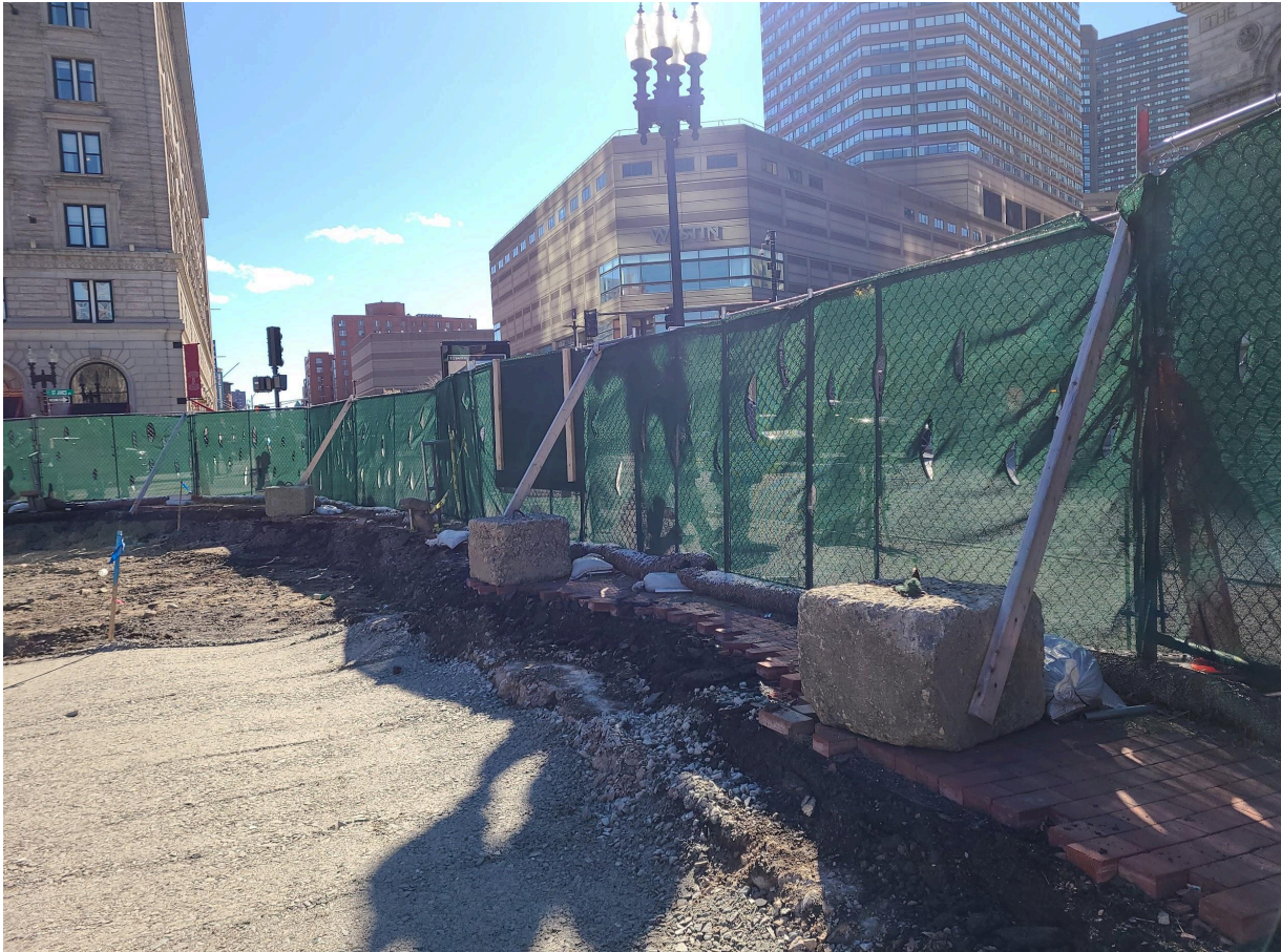
Gravel sub-base material for the paved area by Dartmouth Street is being installed.