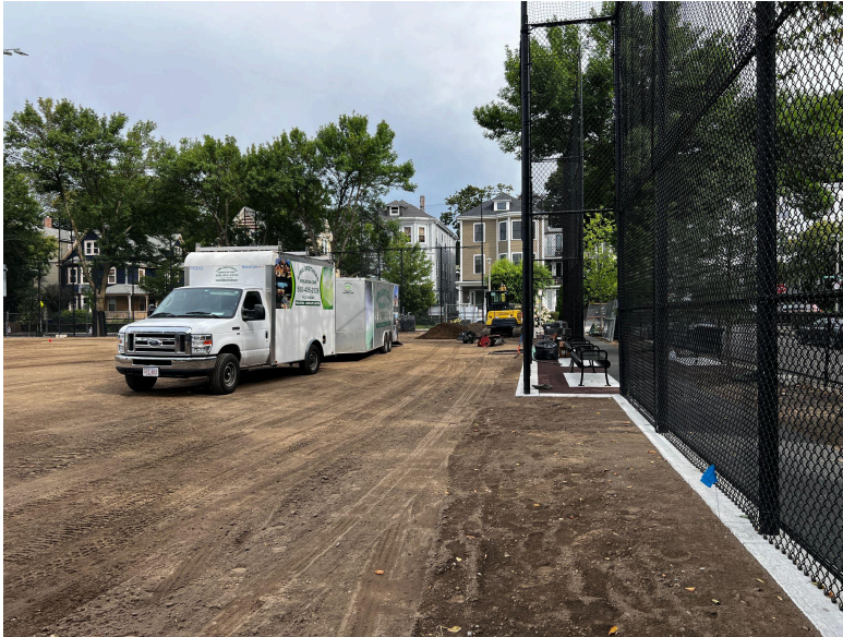
Loam installed prior to sod installation