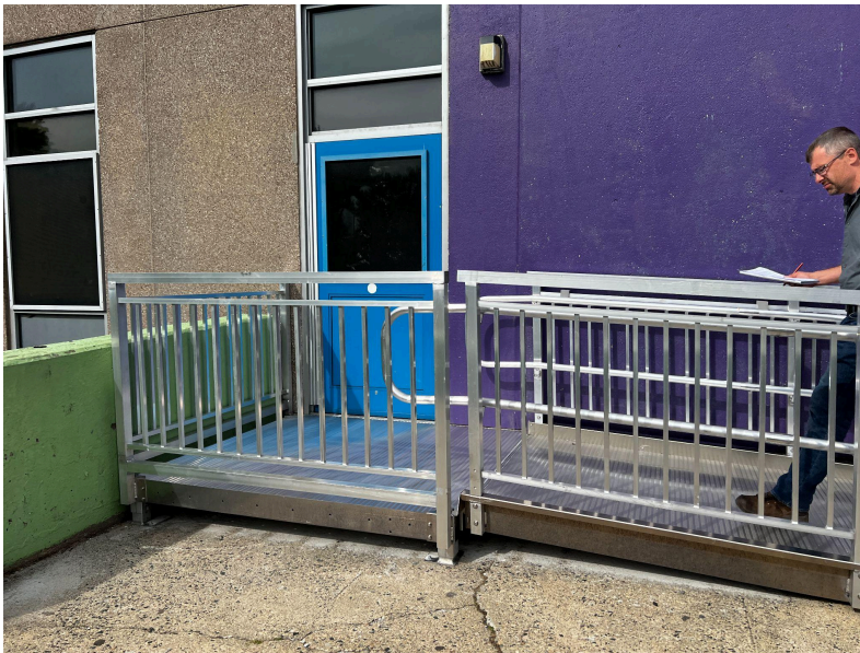
ADA ramp installed at back patio of Margarita Muniz Academy