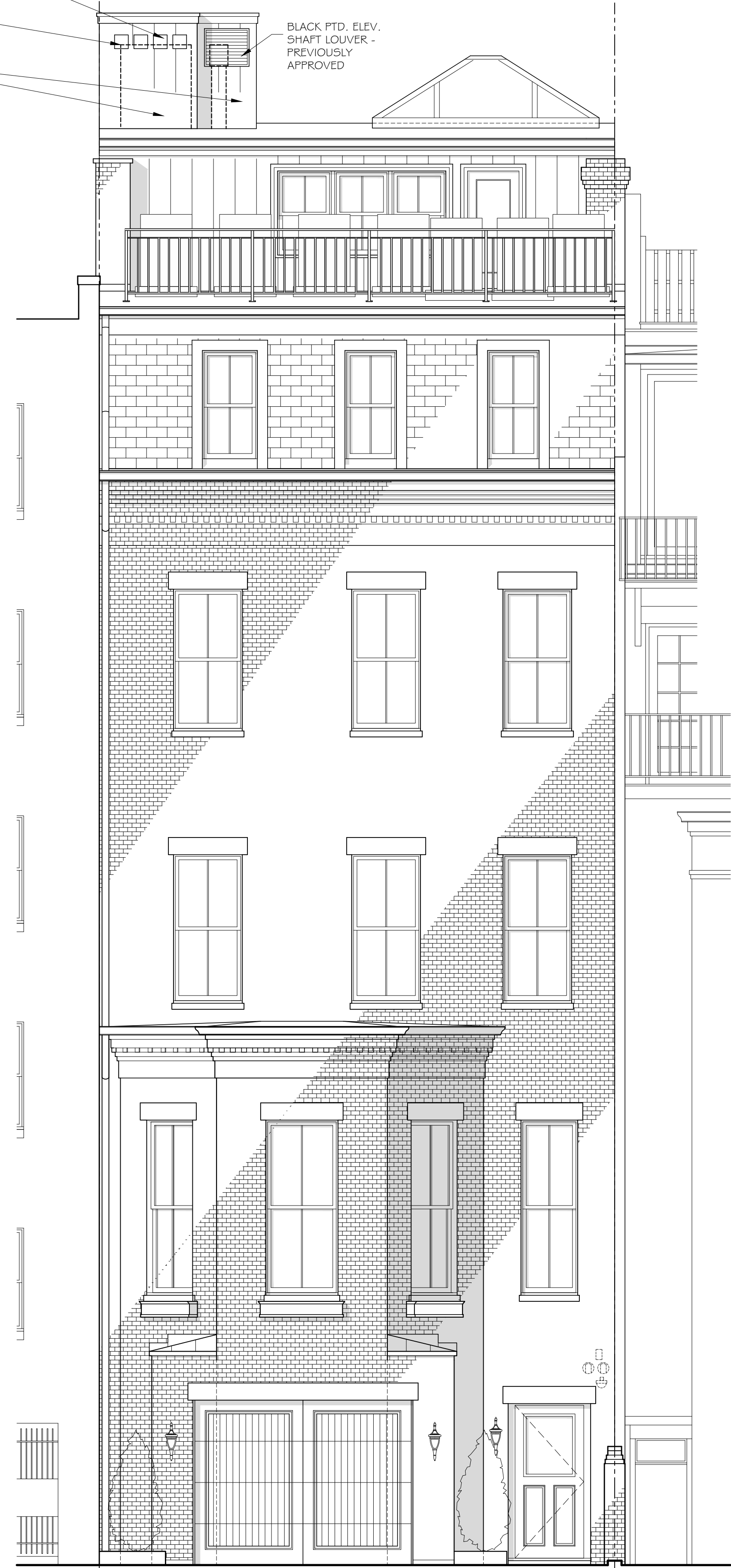
SOUTH ELEVATION SCALE: \frac{1}{4}" = 1'-0"

BLACK PTD. ELEV. SHAFT LOUVER - PREVIOUSLY APPROVED