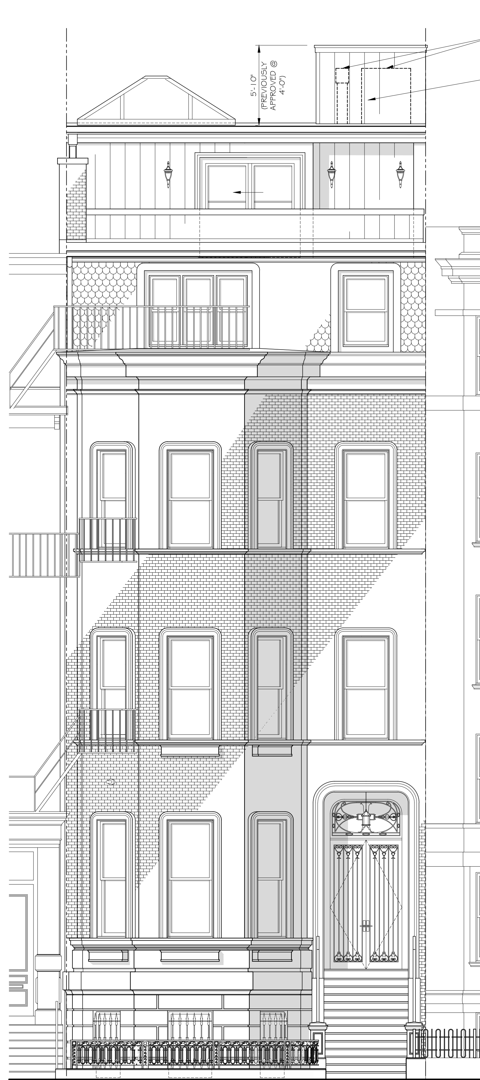
NORTH ELEVATION SCALE: \frac{1}{4}" = 1'-0"

REMOVE (E) VENTILATION TURBINES 4 ELEV. SHAFT VENT HEAD HOUSE - PREVIOUSLY APPROVED (N) STANDING SEAM COPPER HEAD HOUSE AND VENT ENCLOSURE - PREVIOUSLY APPROVED COPPER WALL CAP VENTS - PREVIOUSLY APPROVED