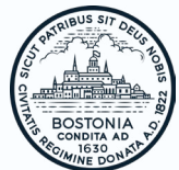
Mayor Michelle Wu Mayor of Boston