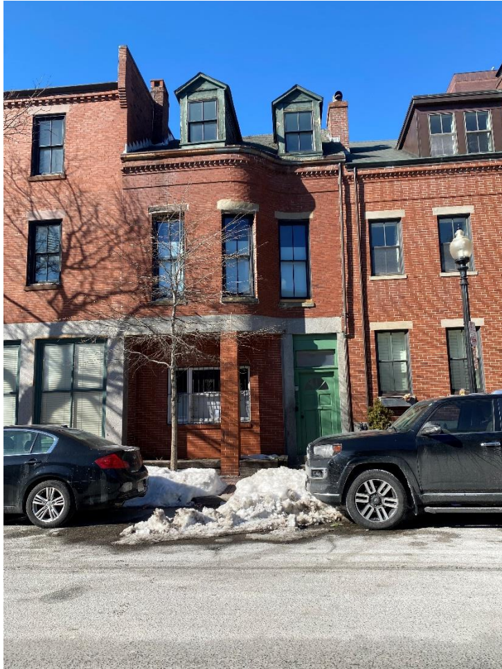
EX'G FRONT ELEVATION