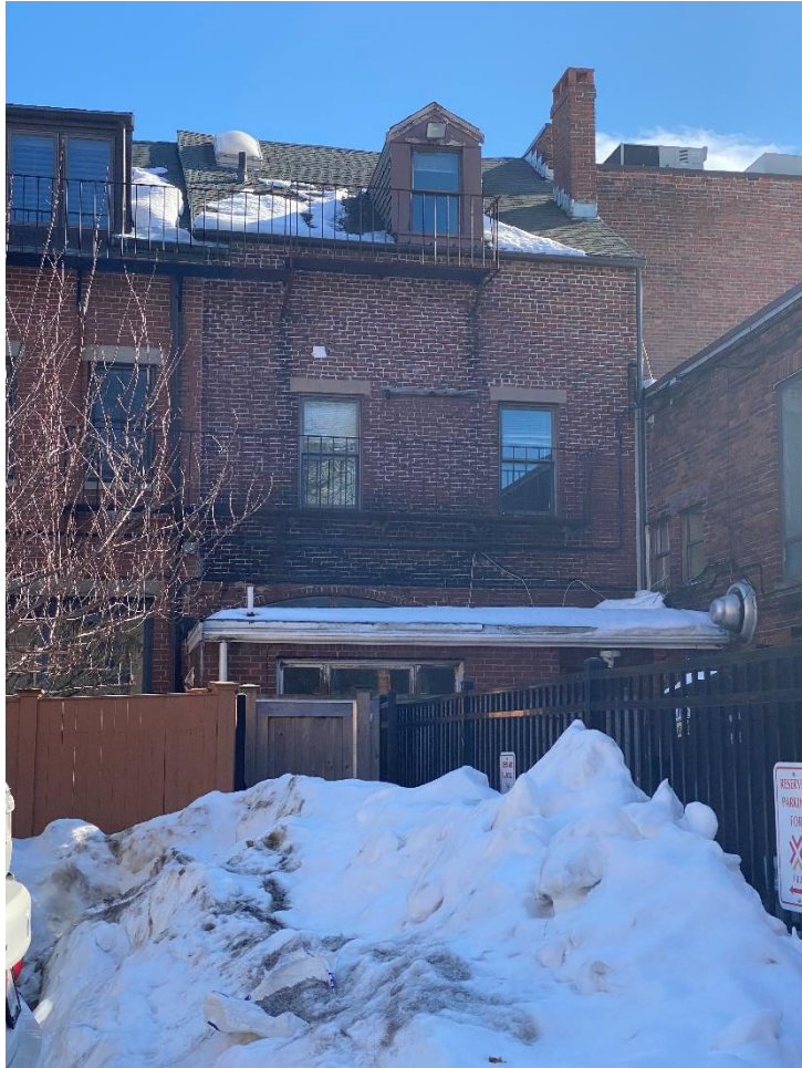
EX'G FRONT ELEVATION