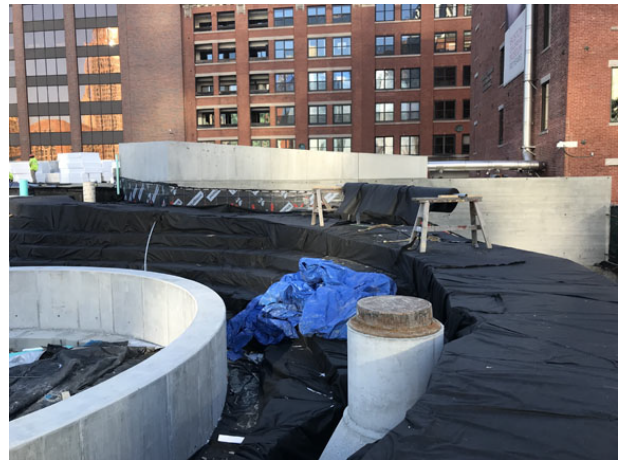
12/20/18- geofoam on back side of circular retaining wall