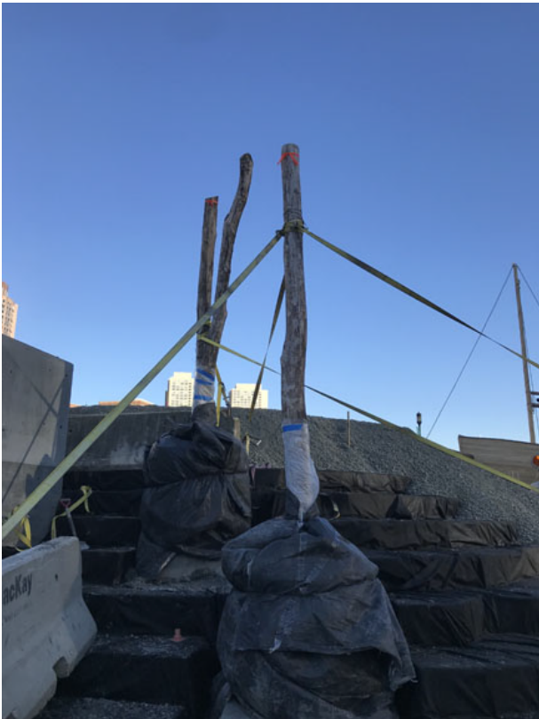
Locust post installation