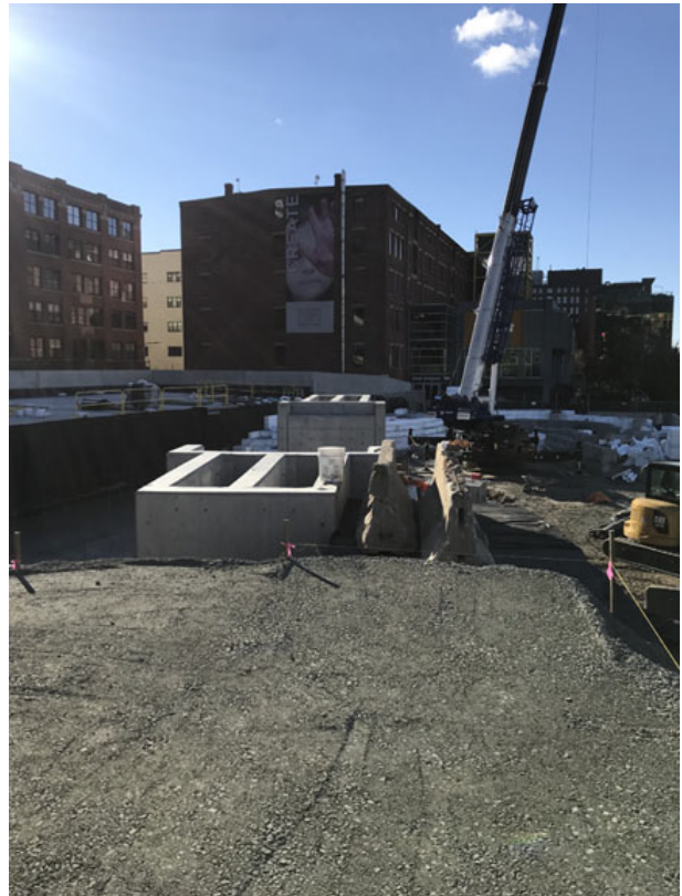
Future pedestrian bridge