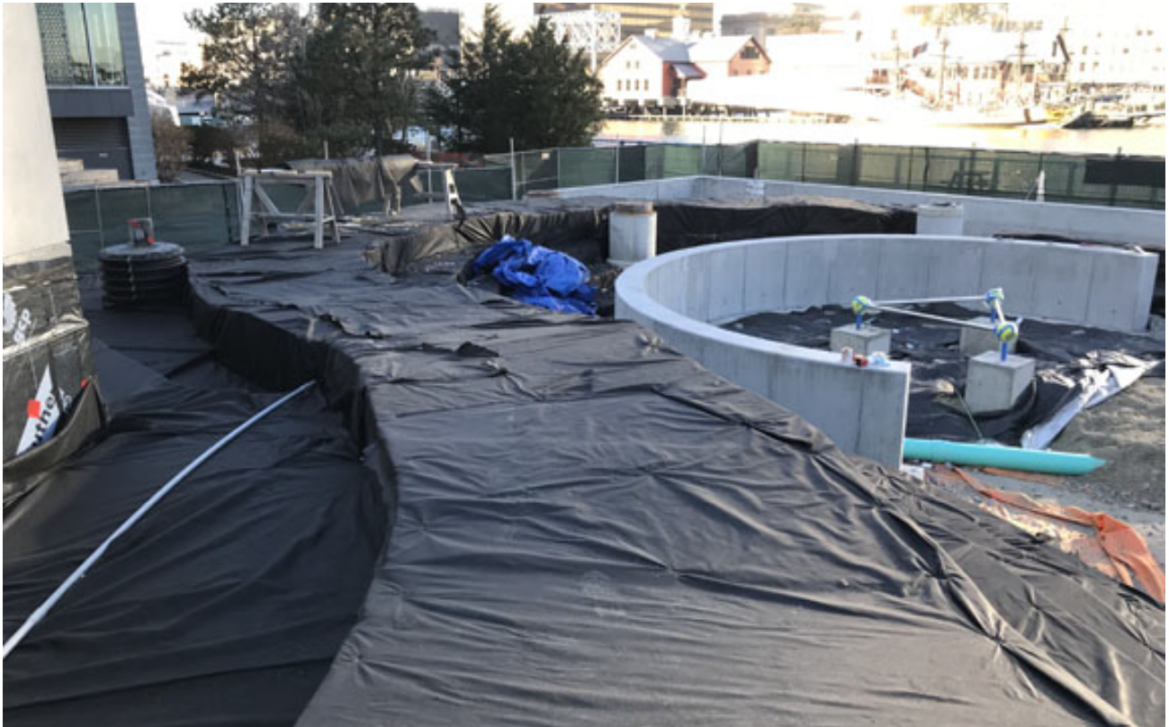
Future pathway to the top of the covered parking roof play area