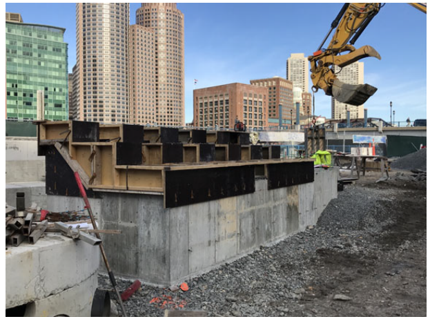
11/18/18- formwork for amphitheater