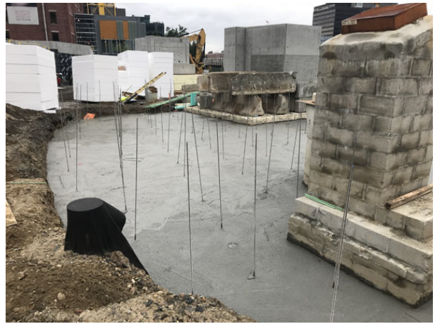
10/15/18- mud slab for geofabric