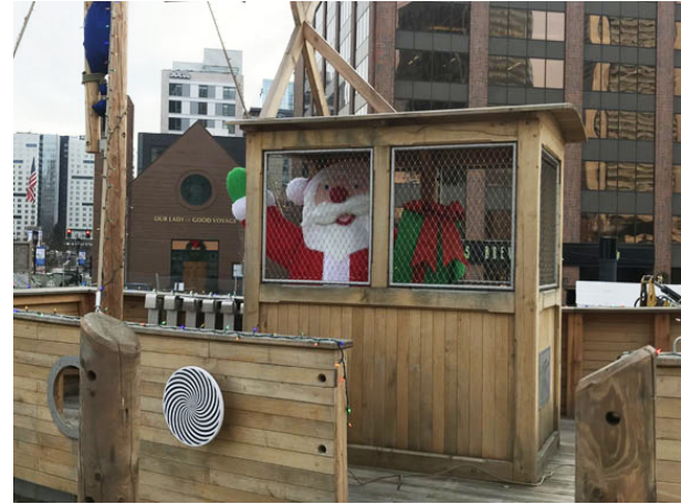
MackKay holiday decorations!