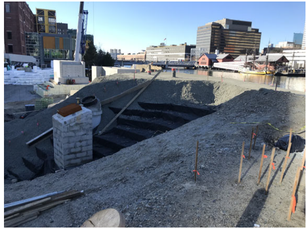
12/7/18- geofabric, filter fabric, soil