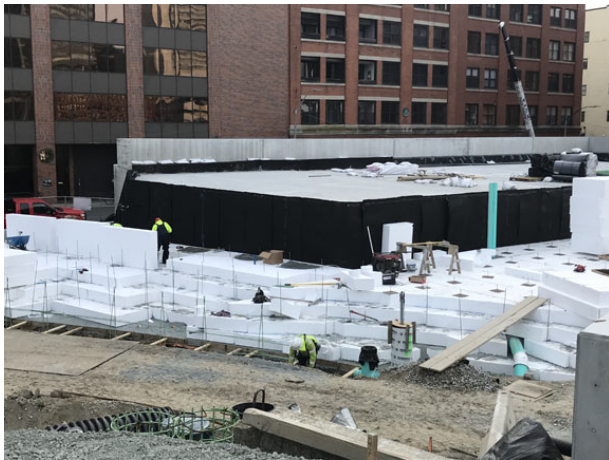
12/13/18- geofabric installation over mudmat