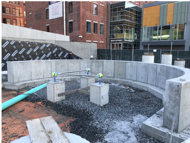
11/28/18- circular concrete retaining wall