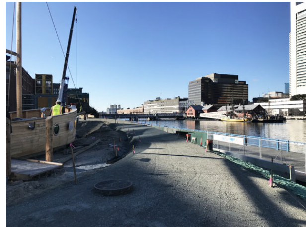
Sub-base for future pathway to play ship