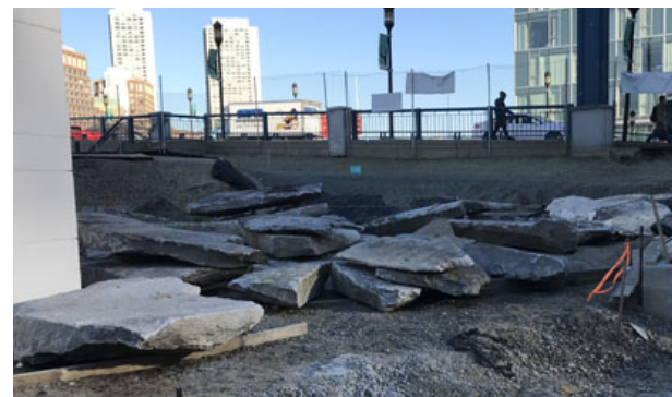
Granite on site