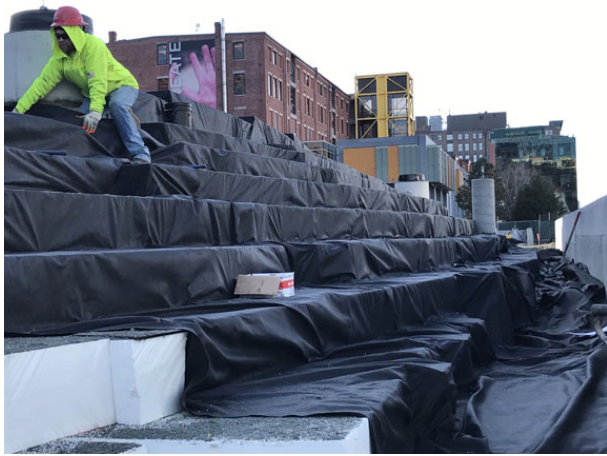
Gofoam wrapped in filter fabric