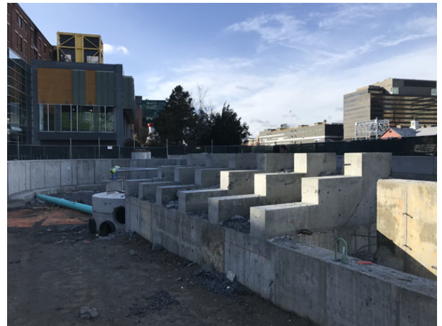
11/28/18- concrete foundation for amphitheater