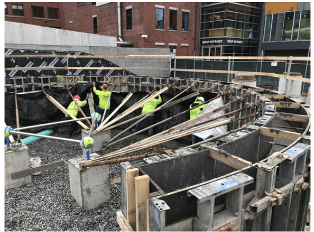
11/21/18- formwork for circular wall pour