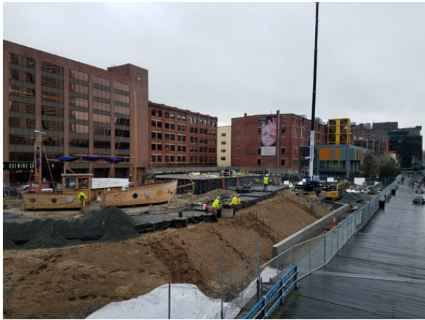
Soil installed over geofabric