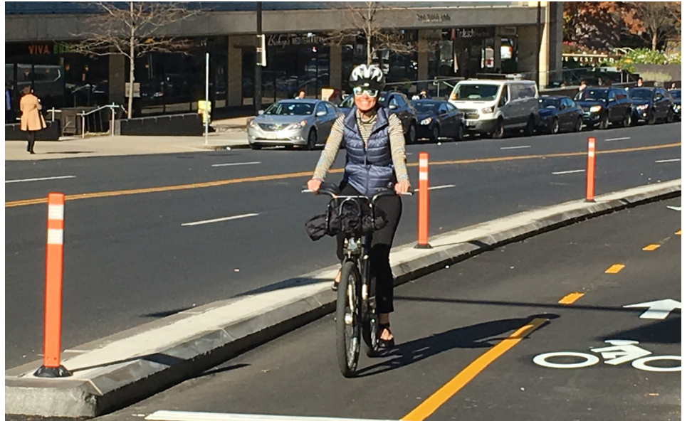
Protected bicycle lane on Staniford Street, Boston

Building better bike corridors has increased cycling rates across the nation and in the Boston region. A connected network of more comfortable routes makes bicycling a more realistic option for people who would otherwise choose to drive or rely on transit. Through the Go Boston 2030 process, the call for building better bike corridors (and facilities that provide "low-stress" connections for cyclists) has been heard from across all neighborhoods and from current and potential cyclists alike.